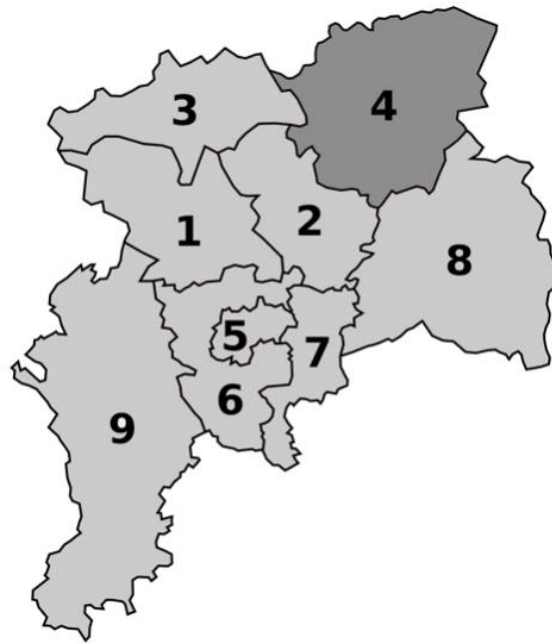
Figure 1. SCR map