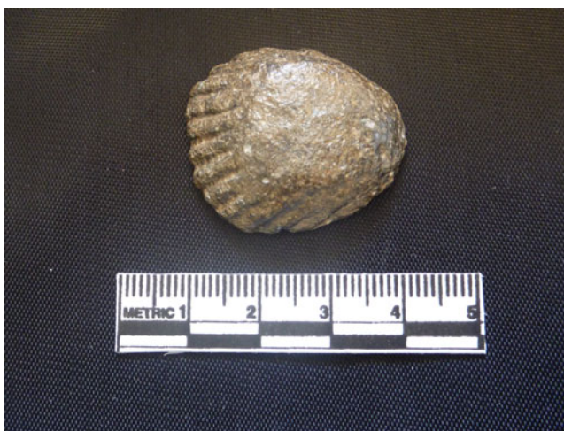
Fig. 1. Lead weight in the form of a shell from the vicus at Vagnari.

The study of the lead from Vagnari is a pivotal step in preparation for a planned collaborative project with Tracy Prowse (McMaster University), whose ongoing investigation of the necropolis at Vagnari has furnished evidence for over a hundred Roman burials. An analysis of lead composition and isotopic signatures will be conducted to determine the origins of the ores and to understand the implications of