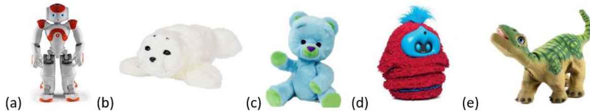
Fig. 1 Social robots used in the identified studies: Nao (a), Paro (b), Huggable (c), Tega (d) and Pleo (e)

of the sixteen included in the review mentioned what types of sanitation the robot require between interactions with children, two reporting on Nao being wiped down [43, 44] and one reporting on Huggable's fur being removed, wiped down and washed between interactions [39]. Sanitation methods are important, as the ability to sanitize the robot may determine its appropriateness to use in a hospital setting.