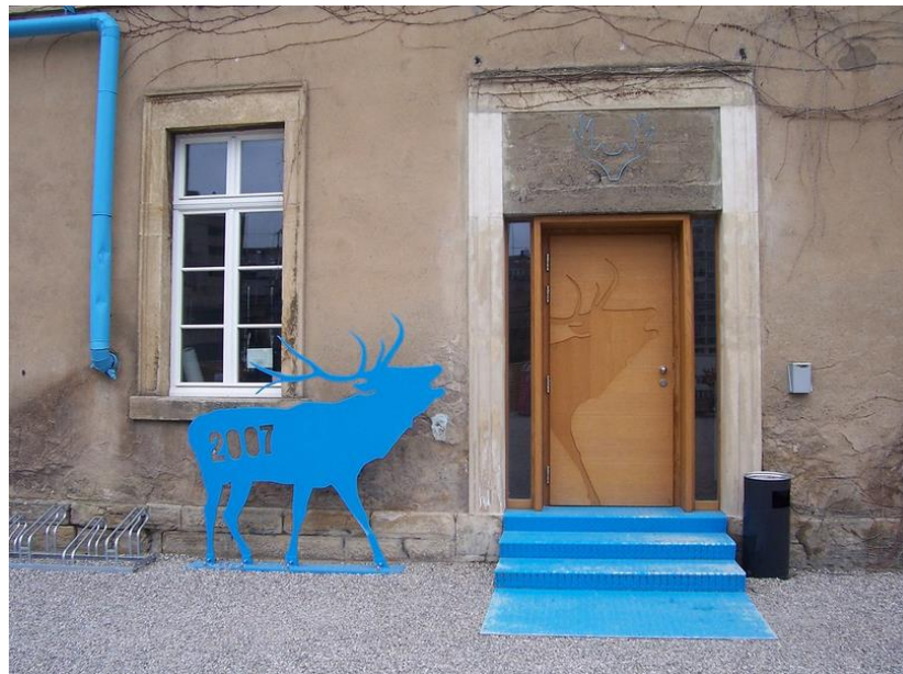
Figure 4. Steel cutout of the Luxembourg 2007 logo by the city's European Capital of Culture headquarters.

At the same time, in an interview I conducted with the communications manager for Luxembourg 2007, she said: “Rebuilding the image of Luxembourg is at the very core of Luxembourg 2007: from outside, Luxembourg is mostly seen as ‘banks,’ so we want to make something new and reactivate creativity.” As a country with one of the largest GDPs per capita in the world, Luxembourg had a budget of €7,000,000 for communication related to the European Capital of Culture alone, and focused on spreading its brand image across the city. For this reason, a plethora of steel cutouts of the whimsical Luxembourg 2007 logo, a blue deer, were strategically placed by major city buildings, in addition to the European Capital of Culture headquarters (Figure 4). The blue deer were sponsored by ArcelorMittal, the world's largest steel company with headquarters in Luxembourg, which was one of the major partners of Luxembourg 2007. In Luxembourg, the hyperbranding extended to street lighting and the 54 types of different branded products that were developed for Luxembourg 2007, with two new products being introduced every month based on the time of the year like, for example, gloves for the winter, and flip-flops for the summer.