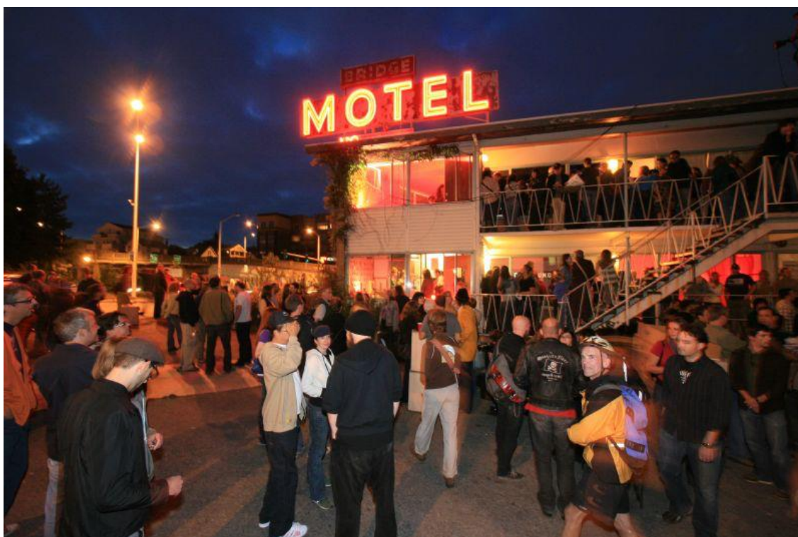
Figure 1. The Bridge Motel event on September 15, 2007.