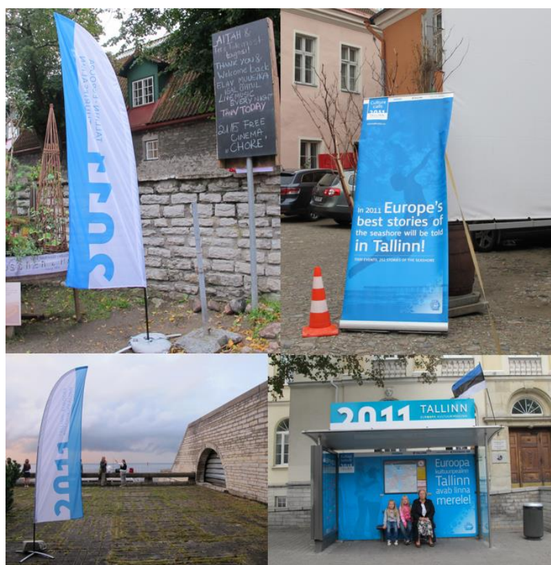
Figure 5. Moveable banners and structures with Tallinn 2011 branding.

This aestheticized signposting of private development in both cities tells us something about the importance of each European capital of culture as a temporary performative stage for lasting corporate business. While the European Capital of Culture title comes with European Commission funding for the required yearlong cultural exchanges and activities, this is also a scheme that aims to “boost” local economies through urban regeneration plans to be fueled both by public and private investment. It is therefore also and foremost by paying attention to both cities’ aesthetics that we can understand this problematic entrenchment of “light” cultural policy and “heavy” globalist capital.