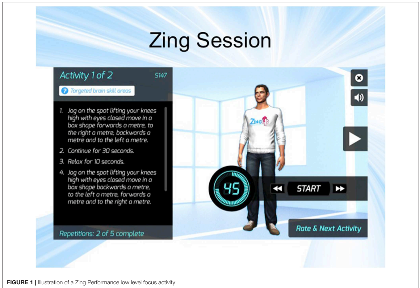
FIGURE 1 | Illustration of a Zing Performance low level focus activity.

Four additional tasks were administered in the study, derived from the Learning Assessment Battery (LAB) (Nicolson, 2010) and the South Yorkshire Ageing Study (SYAS) (Tarmey, 2012) to assess procedural and declarative memory. The SYAS Declarative Memory test probes recall for the details of a sheet of 14 simple clip art pictures presented for 30 s (for example, what color were the clown's shoes?) The SYAS Picture Recall test assesses recall for a set of 20 pictures of common objects, presented sequentially for 1 s, including both immediate recall and delayed recall after 20 min. Procedural Learning was assessed using the LAB Motor Sequence Learning task. This is modeled on Korman et al. (2003) and participants have to learn and repeat a sequence of four finger presses, by resting the four fingers of their preferred hand on the keyboard keys FTUK and then produce a given sequence (e.g., FKUT FKUT FKUT...) 18 times. Two such sequences are used, and the score returned is the number correct on the second sequence, to minimize unfamiliarity effects. The LAB Word Identification Task was also used to assess the display time needed to read a word by presenting the stimulus for shorter and shorter periods. These tests were selected on the basis that there are no other established tests of procedural and declarative learning, and, together with DST-S tests, proved effective in detecting performance changes in a study with Zing in older adults (Gallant and Nicolson, 2017).