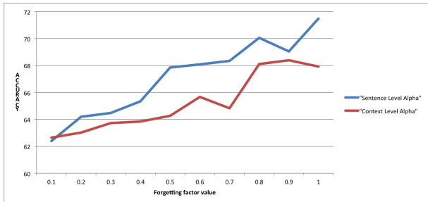
Figure 2: Context level (red line) and sentence level (blue line) forgetting factor test

rithm. To deal with label imbalance in the data, class weights w_i for class i were set proportional to \max(f_i)/f_i where f_i is the frequency of class i .