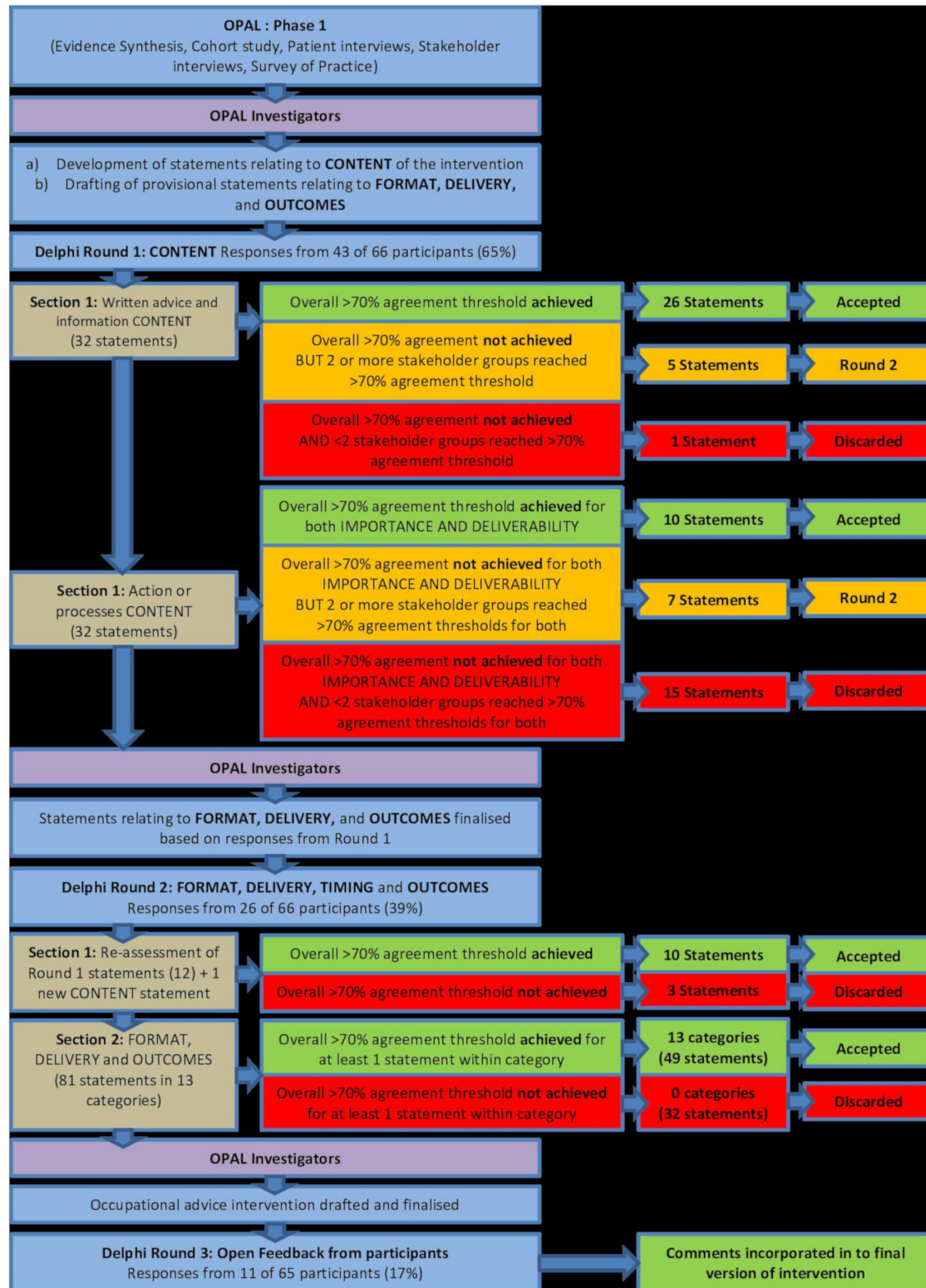
Figure 2 Overview of the opal Delphi process. OPAL, Occupational advice for Patients undergoing Arthroplasty of the Lower limb.

the third round of the Delphi process was positive, validating the use of the Delphi process to support intervention development.