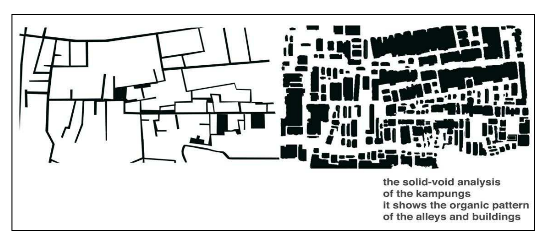
Figure 4 . The solid and void analysis of the kampungs.

Through the contemporary perspective, the reading of kampungs is done by observing the social production of space that occurred in the kampungs. This research undertook two analysing methods: observing the daily rhythm of the kampungs and exploring the perception of the young adults of their kampungs.