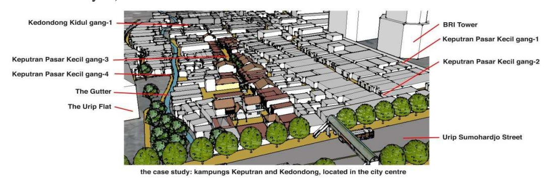
Figure 2. The case study: 1<sup>st</sup> to 4<sup>th</sup> alley of Keputran Pasar Kecil and Kampung of Kedondong Kidul 1<sup>st</sup> alley

The significance of the case study of the kampungs in rethinking Cullen's theory is to fill in the gap of reading kampung through the theory that does not capture what is important in the kampungs; which is meaning. The theory application partly captures the condition of the kampung, mainly on the visual quality. The kampungs grow organically, it could be seen on the pattern of the alley, how to approach the kampungs and also the size and location of the housing plots in the kampungs (see the picture of solid-void analysis).