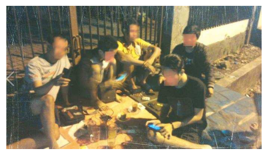
Figure 6. The kampungs' alley for party at one night.