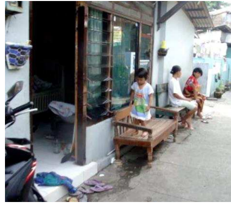
Figure 7. Social spots along the alley.

In negative terms, the respondents highlight the activity of gamblers, drunkards, and jobless people in the kampungs. They considered them as a group of immoral and wild people. These activities produce a feeling of fear in the other dwellers. The group also noticed the specific spots for those activities; they feel safe in their spot/location but unsafe in other specific location that are associated with devious behaviour. This is also a feeling of thereness that develops a sense of place.