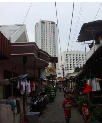
Figure 3. The kampung and the commercial areas as a background.