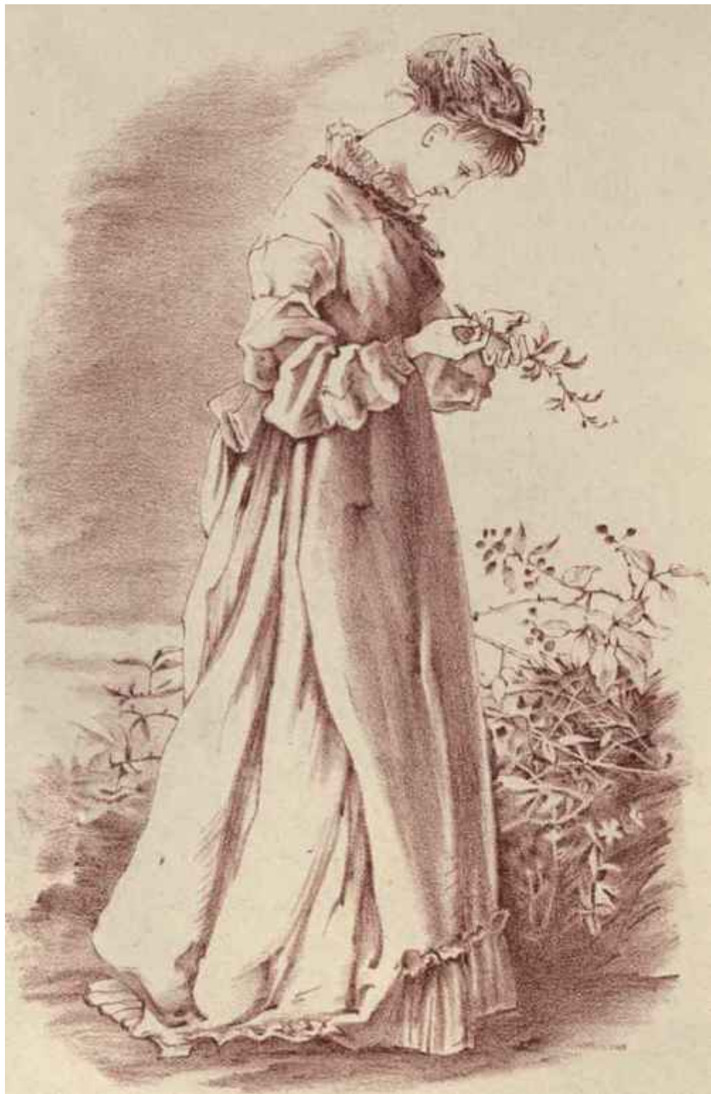
Figure 1: Frontispiece to 'The Art of Decoration' (1881)