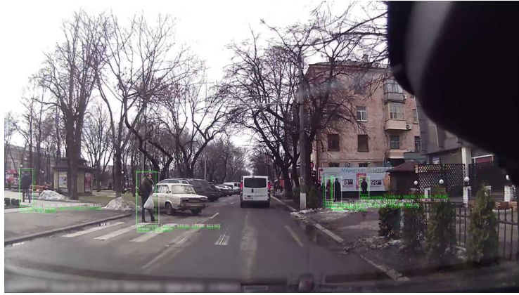
Fig. 1: An Ideal Pedestrian Detection at Crossings