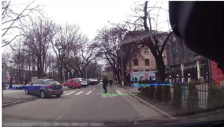
Fig. 2: An Example of Missed Detections at Crossings

It is crucial that the context within which the vehicle is expected to function is clearly and explicitly specified. For road vehicles this is normally done through the specification of the Operational Design Domain (ODD) [7]. J3016 defines an ODD as “operating conditions under which a given driving automation system or feature thereof is specifically designed to function, including, but not limited to, environmental, geographical, and time-of-day restrictions, and/or the requisite presence or absence of certain traffic or roadway characteristics” [19].