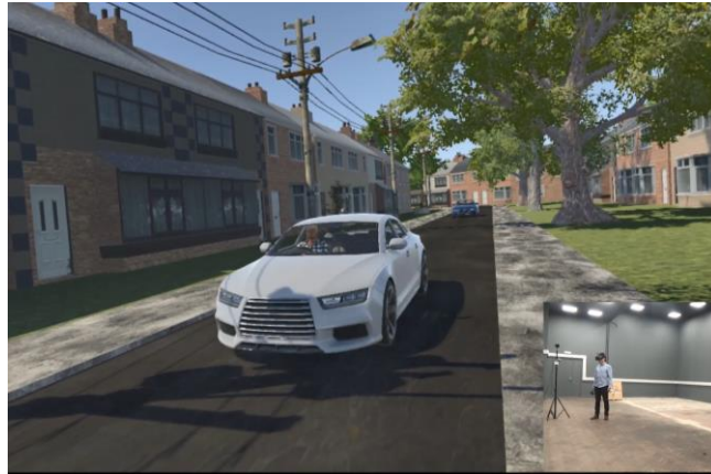
Figure 2 – Depiction of one of the VR studies, showing participant with the HMD and the road environment used for studying crossing behaviour

ference in crossing initiation time between the different concepts, participants reportedly preferred animations and symbols to static images [22].