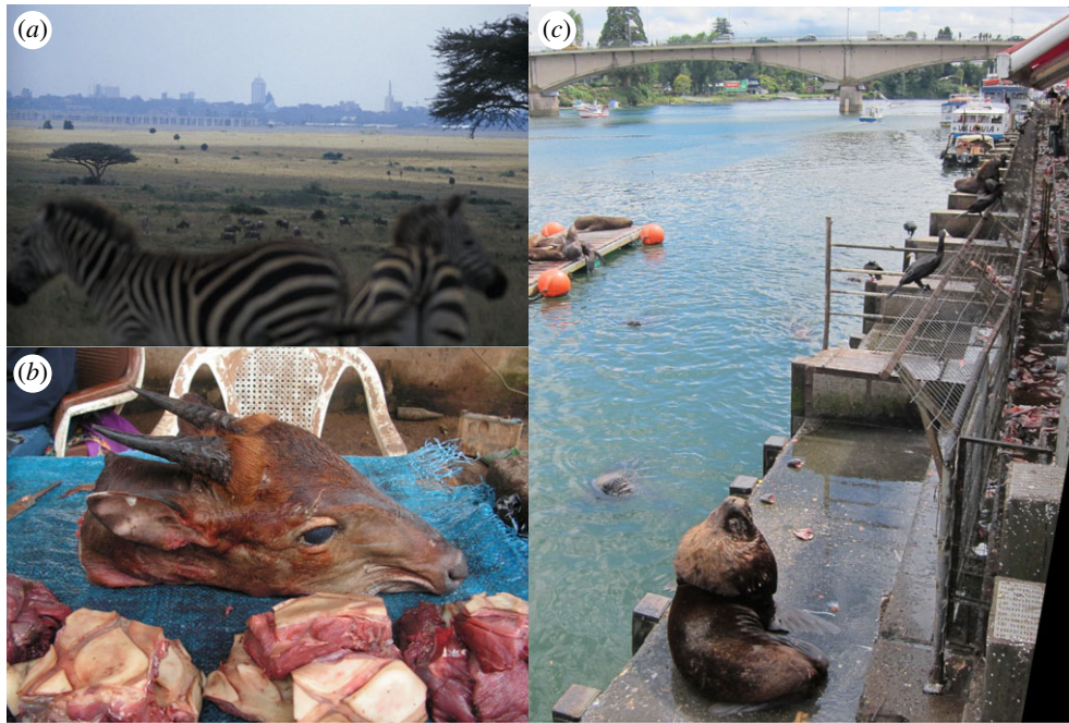
Figure 1. Biodiversity under threat. (a) Plains zebra ( Equus quagga ) and blue wildebeest ( Connochaetes taurinus ) by Nairobi, Kenya. (b) Carcass of a Peter's duiker ( Cephalophus callipygus ) for sale in Makokou, Gabon. (c) South American sea lions ( Otaria flavescens ) in Valdivia, Chile. (Online version in colour.)

priority. This theme issue is motivated by the conviction that the most cost-effective way to obtain conservation impact indeed often involves behavioural ecological study [3–5]. The fact that the most immediate response of animals to environmental change typically is behavioural puts behavioural ecology in a central position to inform natural resource management [6]: not only can behaviour serve as an early warning system of environmental deterioration, behavioural changes also directly or indirectly affect vital rates, i.e. survival and reproduction, the very key parameters determining the dynamics of populations and their aggregate communities. It is the links between behavioural ecology via population and community ecology to conservation on which this theme issue concentrates.