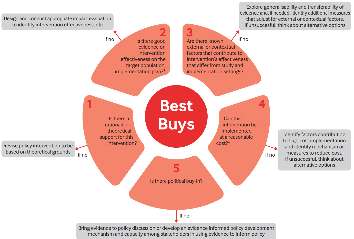
Fig 2 | SEED tool for determining whether an intervention is likely to be worthwhile in a local context. The tool has two sections: the inner circle aims to assist NCD programme managers in thinking critically about the intervention and the outer boxes provide recommendations for strengthening the evidence base. *Implementation=dosage, frequency, duration, coverage, etc, †Compared with the cost of implementing a similar programme in other settings or the costs in the economic evaluation studies used to decide to implement the intervention

evidence generated elsewhere to local settings is not straightforward, 14 22 23 25 we suggest using a scrutiny sequence starting with an initial environmental scan of the economic evidence (high or low income, organisation of healthcare, local prices, etc), followed by a data transferability assessment (see web supplement). 19 26 An institutional hub of national or regional technical expertise could support NCD managers in obtaining a clearer understanding of the local implications for health technology and transferability assessment.