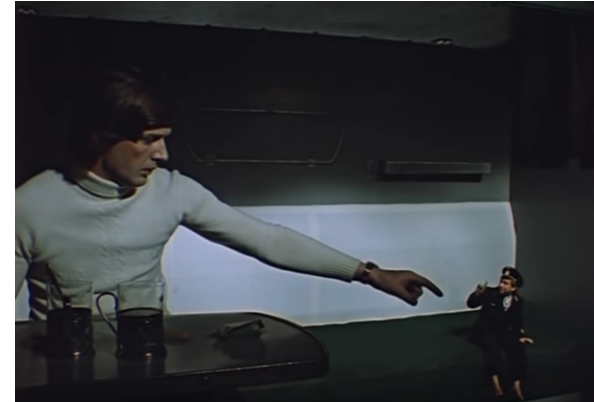
Figure 3: Still from Charodei [9], a 1982 TV adaptation.

"Monday" is an interesting book because the main themes are around academia and academic working in the space of emerging technology. The book is a series of vignettes set in the (Soviet) National Institute for the Technology of Witchcraft and Thaumaturgy (NITWITT), a research organisation that deals with the investigation of the fantastical.