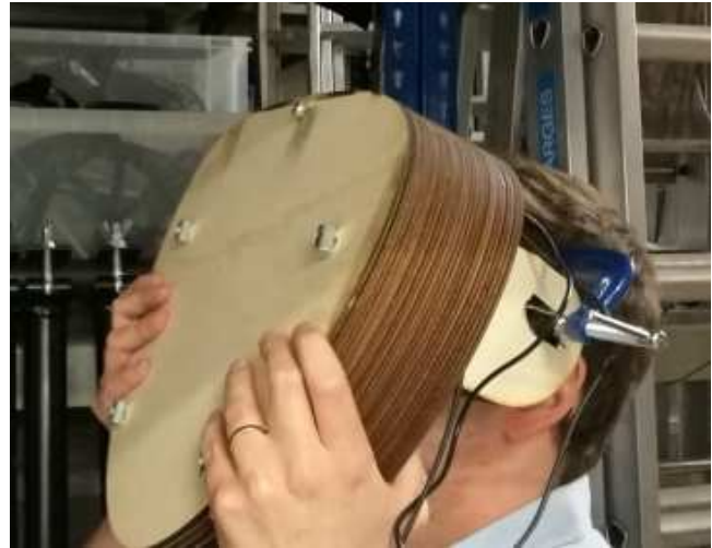
Figure 2: User testing the Viking VR headset

from multiple disciplines and specialisms, from both partner organisations, was drawn on during the design and development stages. This included academics from Archaeology, TFTI, Electronics and English specialising in game design, electronics, historic languages and museum studies, and Yorkshire Museum's curation, digital engagement, education and visitor management teams.