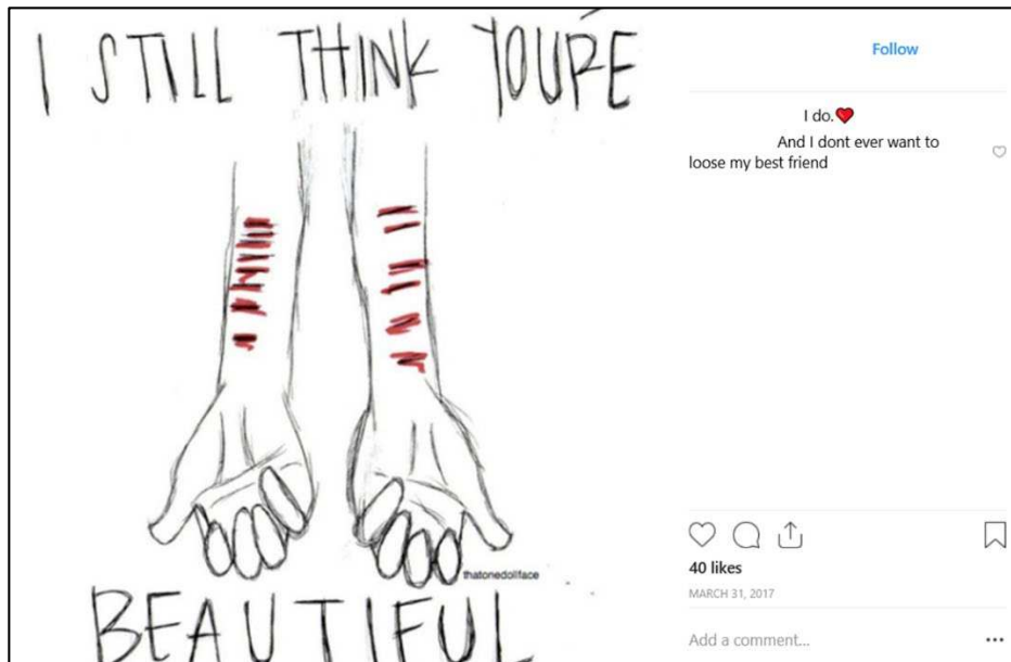
Figure 4: An example of Embodied post, not tagged

graphic text signals those embodied experiences, while guarding against direct visual connection with the user themselves: