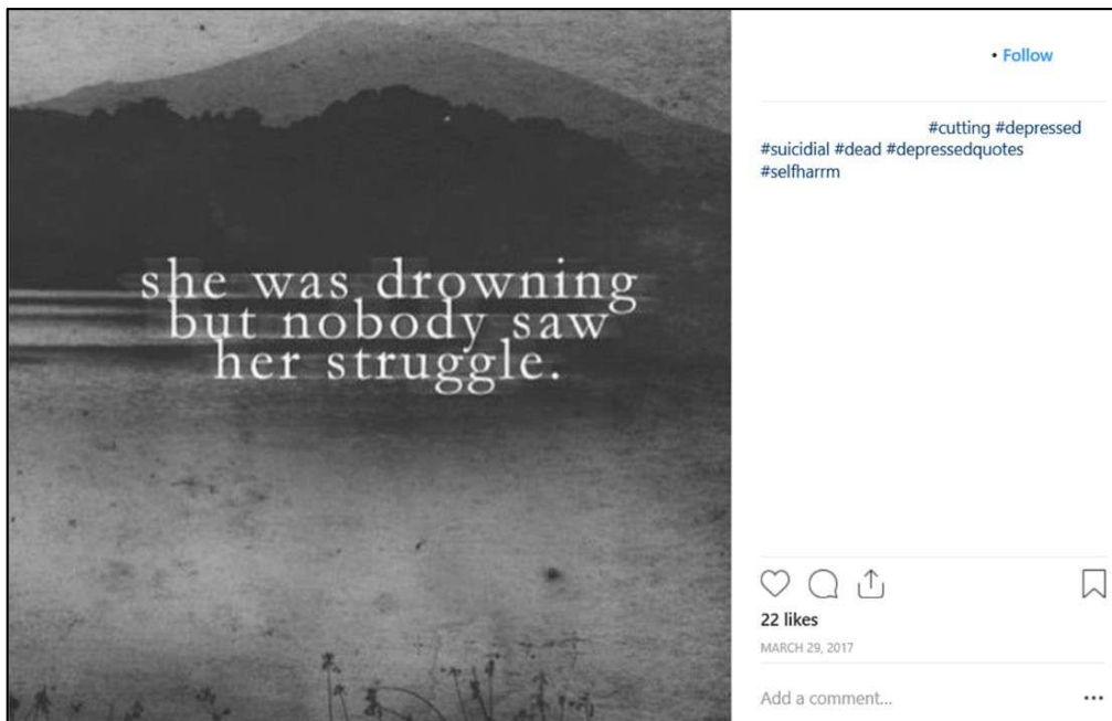
Figure 2: An example of a negative Inspiration post and the 'sad' aesthetic.

Aestheticised content of this kind is 'connectable' and consistent, enabling the affiliation capacities associated with hashtag use. Zappavigna calls this kind of communication 'ambient affiliation': how 'virtual groupings afforded by features of electronic text [...] create alignments between people who have not necessarily directly interacted online' (2012:1). Most often, these posts were associated with accounts we categorised as 'dedicated' accounts, set up with the aim of posting a consistent type of material associated with aspects of depression (whether positive or negative). The beauty of hashtags is that they connect people who are not typically connected to each other. The unique aesthetic of #depressed posts that we have uncovered here – along with the aesthetics of untagged posts relating to depression – are easily recognisable, and users who have never communicated before can instantly share their experiences through their tagged posts. Baym explains that online communities are often formed through such shared practices; that is, they can be found in the 'routinized behaviors' that groups members share, and which include 'insider [...] genres, styles, and forms of play' (2010:73).