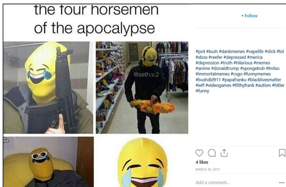
Figure 3: An example of a Memes and Play post.

Many posts used hashtags in this way for their interpersonal function of generating connections or affiliation (Zappavigna, 2012). But coupled with the ideational aspects of #depressed, memetic logic emphasises edgy disruption, provocation, and subversion as forms of pathos. This use of the hashtag may be easily dismissed as unrelated to a core experience of depression or its aesthetic expression. However, these posts engage deliberately with depression-related hashtags in a performative and connective sense through provocation, often as a way of pushing content boundaries. In his account of ‘memetic logics’, Milner (2016) notes the use of memes in a range of tactical interventions into public conversation. Similarly, for Zappavigna (2012:101), ‘internet memes are deployed for social bonding rather than for sharing information. Humour is a very common strategy supporting this bonding’. In other words, memes act as a semantic resource and tool for establishing ‘otherness and in-ness’ (Eggins and Slade, 1997; Zappavigna, 2012:103). An example of a meme in our #depressed dataset is shown in Figure 3.