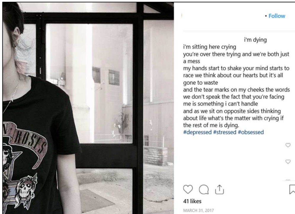
Figure 6: An example of an Embodied post, Personal General account.

Figure 6 shows a partial selfie with an intimate, confessional caption referring to mental health distress. While this user posts many similar selfies or partial selfies, this is their only post tagged #depressed. Among their posts there are other visual signs of depression (an image of them in a bathtub simulating cut-wrists, for example, or bandaged wrists with what looks like fake blood), but without any explicit acknowledgment of depression through tagging practices or captions. The lyrical style of the caption aligns with her self-identification as a musician, but also pairs this post with affective status-statements in combination with the three hashtags #depressed #stressed #obsessed. In linguistic terms, the coupling at play here is the 'tell', or indicator of connection with the ideation of #depressed perhaps more so than with the interpersonal collective or community. More than other #depressed post practices, Embodied posts take on the issue of the potential 'social estrangement' (Ratcliffe, 2015:28) that underlies the heterogeneous experiences of depression and related forms of mental ill-health. But their more direct expression of mental health distress is riskier than the