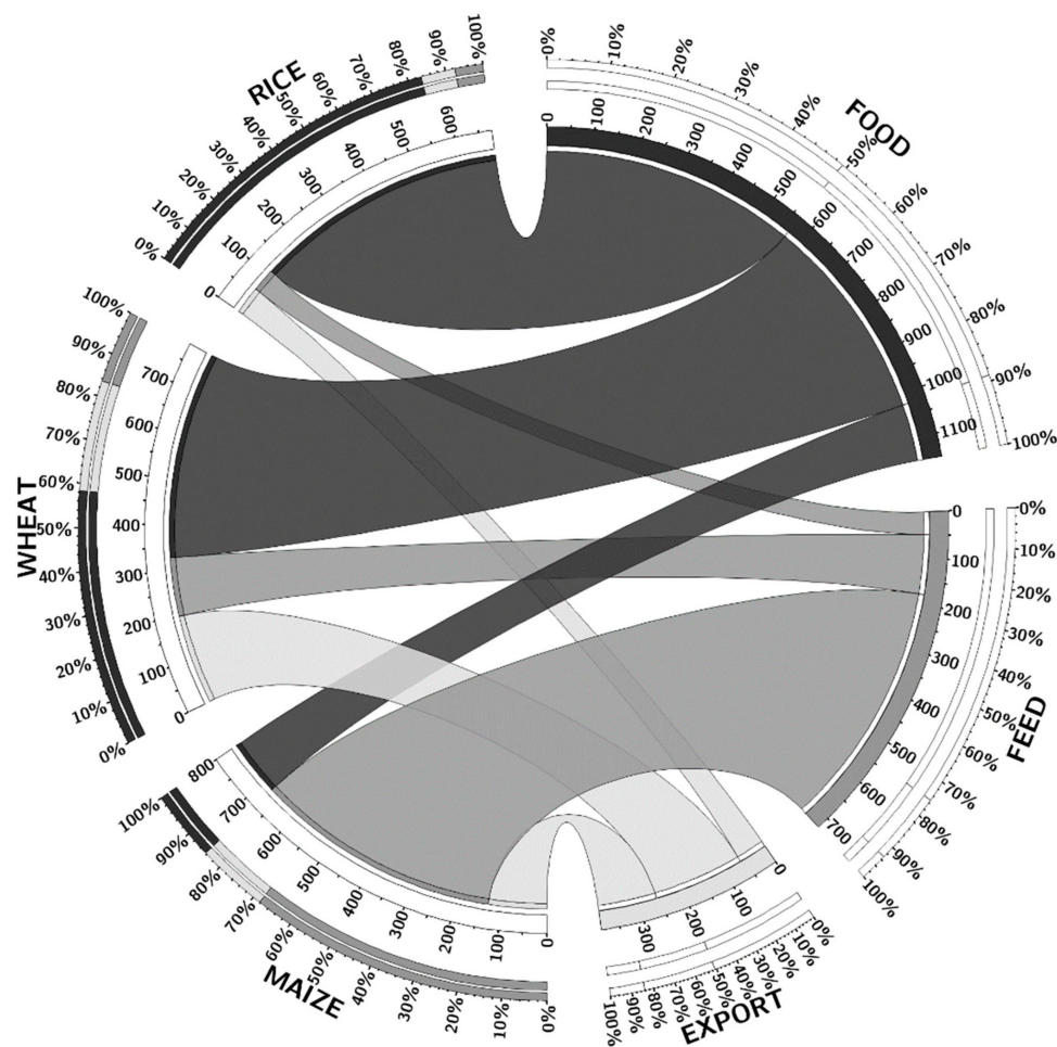
Figure 1. Synteny assessment for rice, wheat and maize with food, feed and export mass ( 10^6 tonnes and ratio as a percentage of the total). The inner axis shows the amount of crop in million tonnes. \text{yr}^{-1} and the outer axis shows the proportion as a percentage. Plots developed using Circos Table Viewer v0.63-9 © 2008–2019 [21].