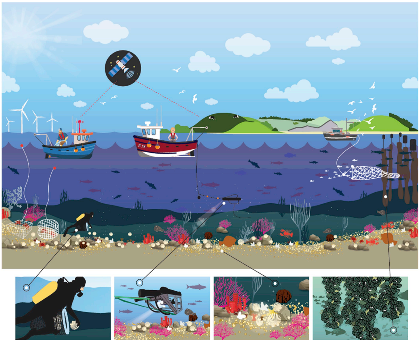
Fig. 1. Ambitious marine conservation 1) Reflects an ambition for sustainable livelihoods by fully integrating fisheries management with conservation (Ecosystem Based Fisheries Management) as the two are critically interdependent; 2) Establishes a world class and cost effective ecological and socio-economic monitoring and evaluation framework that includes the use of controls and Sentinel Sites to improve sustainability in marine management; 3) Requires a shift from managing individual marine features within MPAs to whole-sites to enable repair and renewal of marine systems; and 4) Challenges policy makers and practitioners to integrate MPAs into the wider seascape as critical functional components rather than a competing interest and move beyond MPAs as the only tool to underpin the benefits derived from marine ecosystems by identifying other effective area-based conservation measures (OECMs) to establish synergies with wider governance frameworks.

Within the EU Marine Strategy Framework Directive (Directive 2008/56/EC) sea-floor integrity is a descriptor used to assess Good Environmental Status [47]. Good Environmental Status is considered to be met when, ‘sea-floor integrity is at a level that ensures that the structure and functions of the ecosystems are safeguarded and benthic ecosystems, in particular, are not adversely affected’ [48].