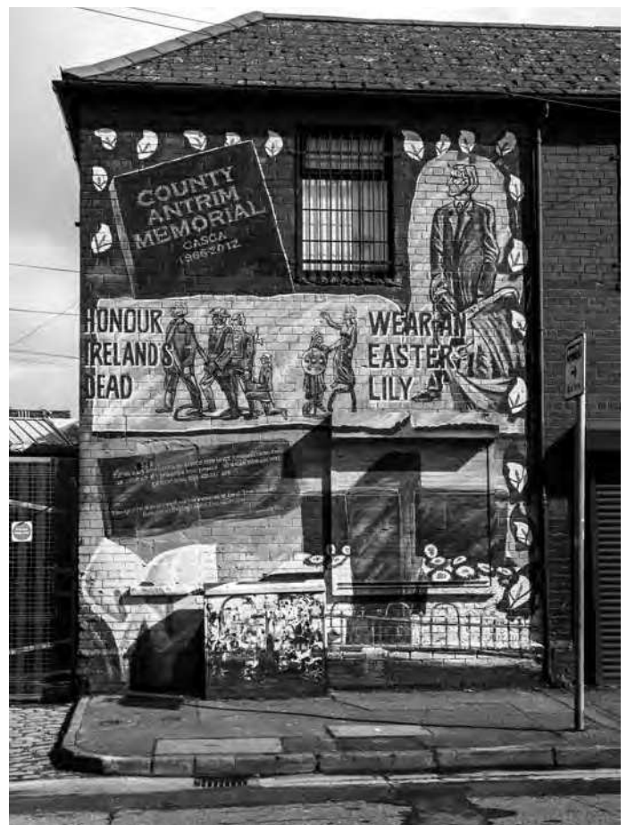
Photograph 12. County Antrim memorial Beechmont Avenue