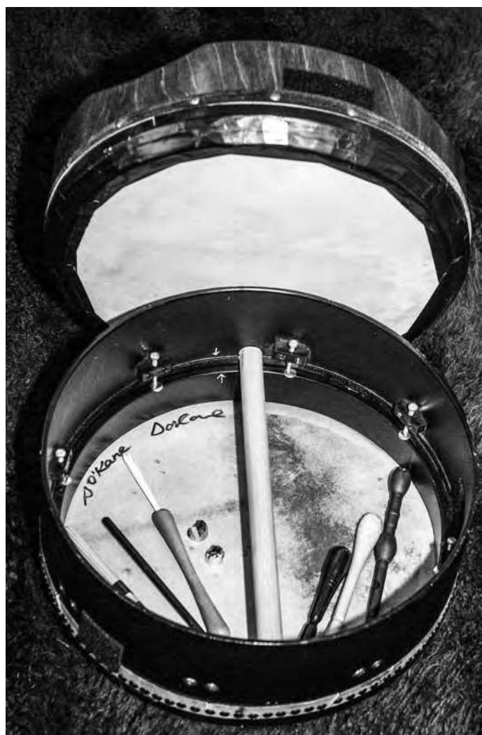
Photograph 23. Two bodhrans and some tippers 7

The smaller Bodhran (pronounced bow-ran), varying between around 12” to around 20”, gets its name from the Irish for deaf ‘bodhr’ and means ‘the deafener’ (Photograph 23). It is usually made from goatskin but may be made from a variety of other skins including dogskin. Frame drums broadly, like this, are very ancient and found all over the world, but Ireland has a range of characteristic styles of playing. This is most commonly with one hand using a double-ended stick which again can be made from a variety