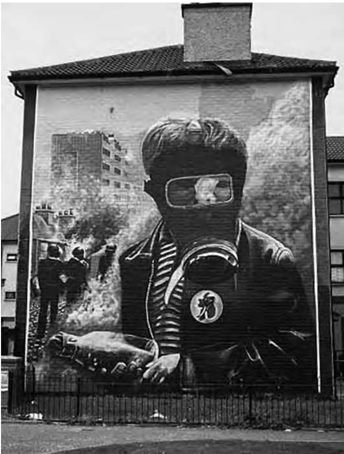
Photograph 21. The Petrol Bomber Rossville Street Derry (© The Bogside Artists, reprinted here with permission)

The Lambeag drum, named after the town of Lambeag in County Armagh, is a large bass drum which descended from the European military snare drum (Photograph 22). It has a presence in Ireland in the late 17th Century possibly introduced by the troops of William III (there is a similar if smaller drum in Rembrandt's painting 'The Night Watch' from 1649), but the term 'lambeag' appears to date from the early 19th century (Hastings, 2003; Scullion, 1982). The use of long, curved malacca or bamboo canes rather than heavier solid sticks with soft cloth dampers appears to have been initiated by Lambeag manufacturers. With dimensions of 93 centimetres in diameter, 61 centimetres depth and a weight of 20 kilograms it is larger than a normal marching