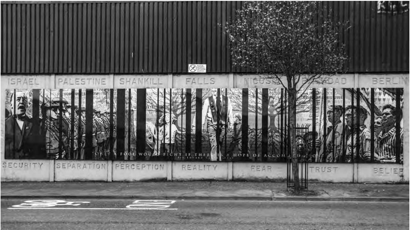
Photograph 19. Cupar Way mural