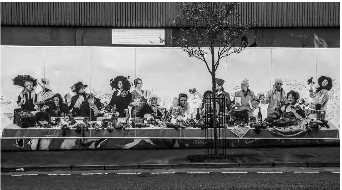
Photograph 20. Banquet by Rita Duffy

– 12 full house-end murals telling the ordinary Bogside's story from the first civil rights demonstrations, to a final aspirational peace abstract. Along the way they painted The Petrol Bomber (Photograph 21), which has become one of the most iconic and photographed murals in the world. Their objective was not, they are adamant, partisan, but to open up a piece of history, through art, for reflection. What they achieve, though figurative, literal and often monochrome styles, offers a dramatic deconstruction of the mythology around the Troubles, and is a powerful