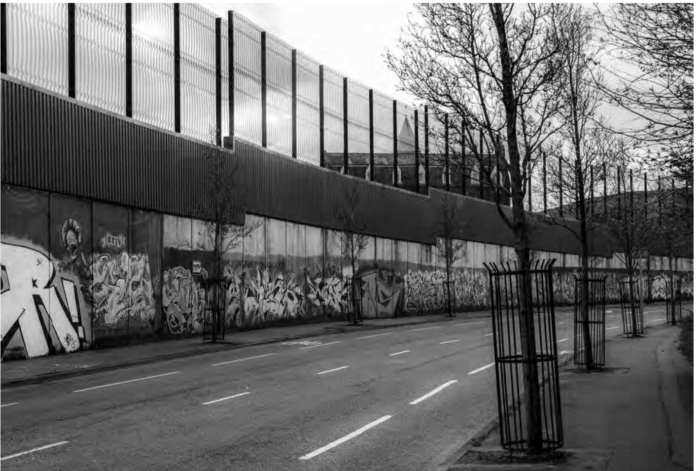
Photograph 10. North Howard Street fence with tags