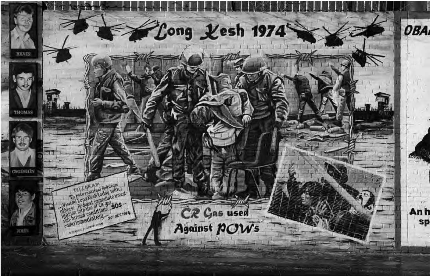
Photograph 15. Long Kesh mural Divis Street