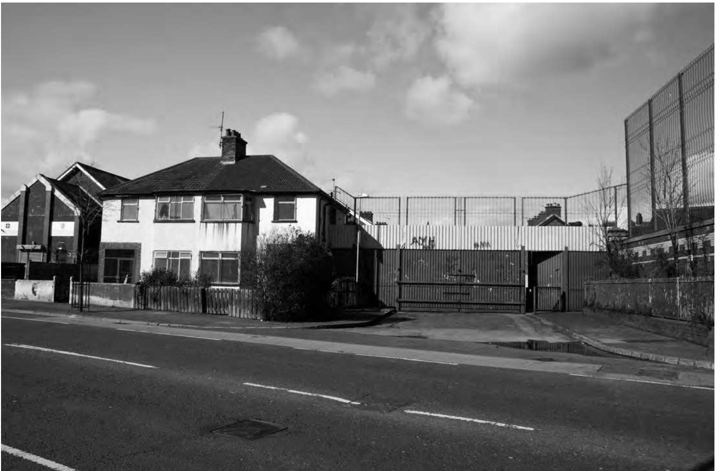
Photograph 8. Forthspring gate – Springfield Road

– see our examples from Northumberland Street (Photograph 7) and Forthspring (Photographs 8 and 9). But in other places street art has proved irrepressible, whether coordinated and organized as a community project or more