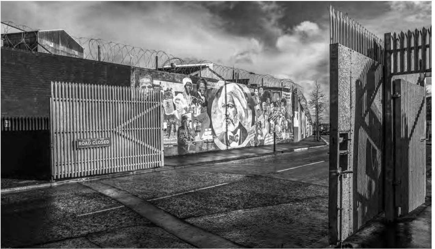
Photograph 7. Northumberland Street gate – Divis Street side

where there is no sense of communities trying to express themselves; they're merely trying to protect themselves. Gates, where they appear across the access roads through the walls, may be closed on curfew or at particular periods