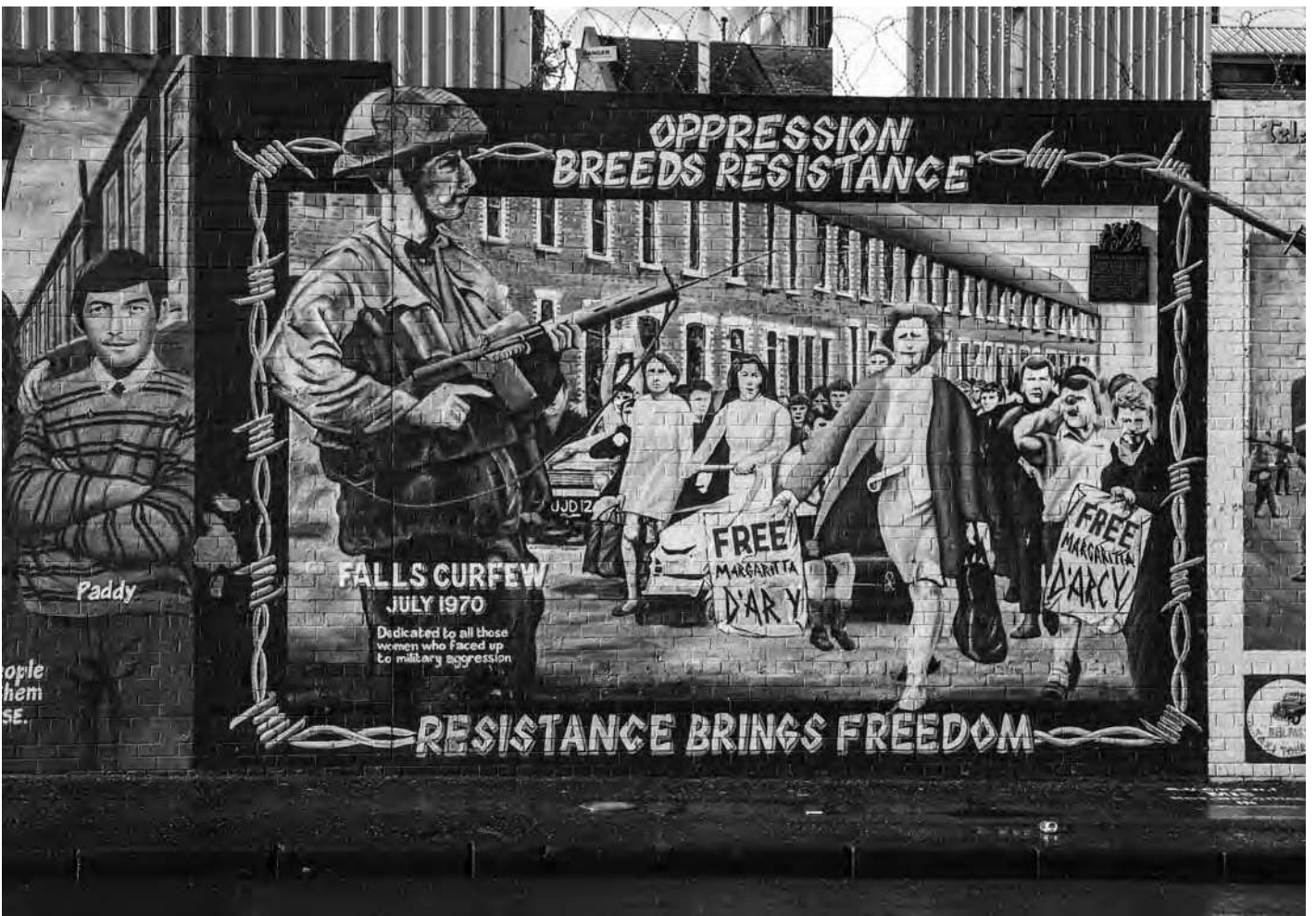
Photograph 16. Falls Curfew oppression mural Divis Street.