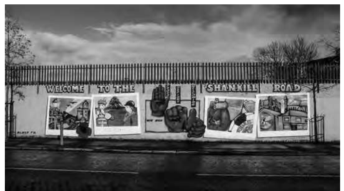
Photograph 3. Protestant mural – Welcome to Shankill between communities.