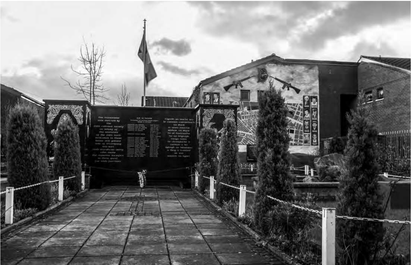
Photograph 13. Falls Road Garden of Remembrance