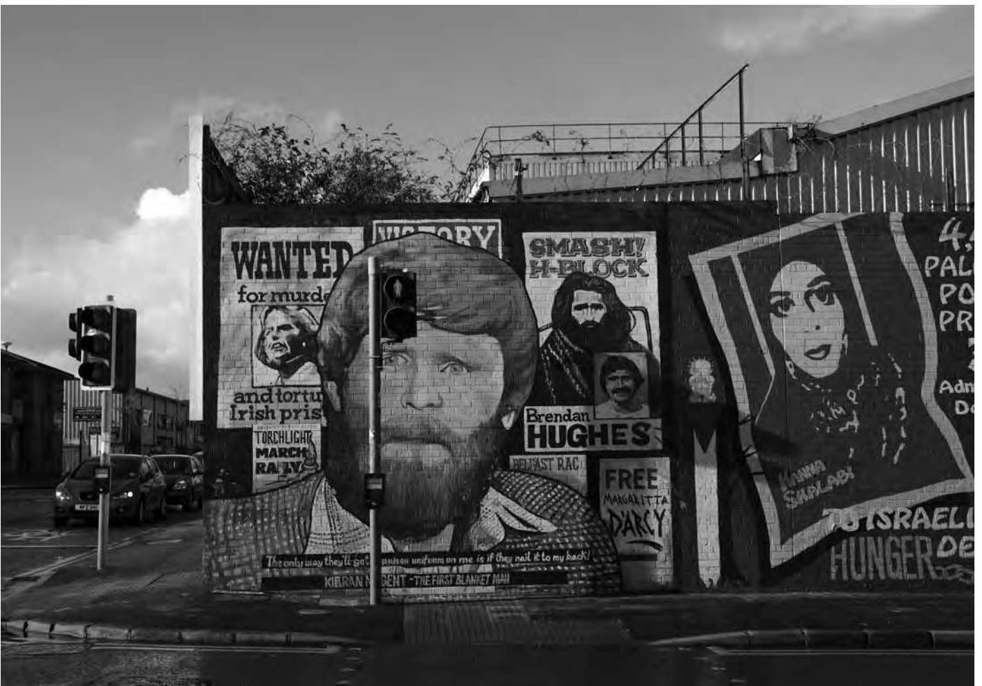
Photograph 14. Kieran Nugent – Blanket man mural Northumberland Street-Divis Street