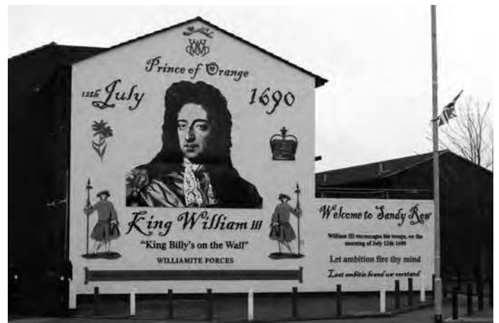
Photograph 2. Protestant mural – King Billy, Sandy Row