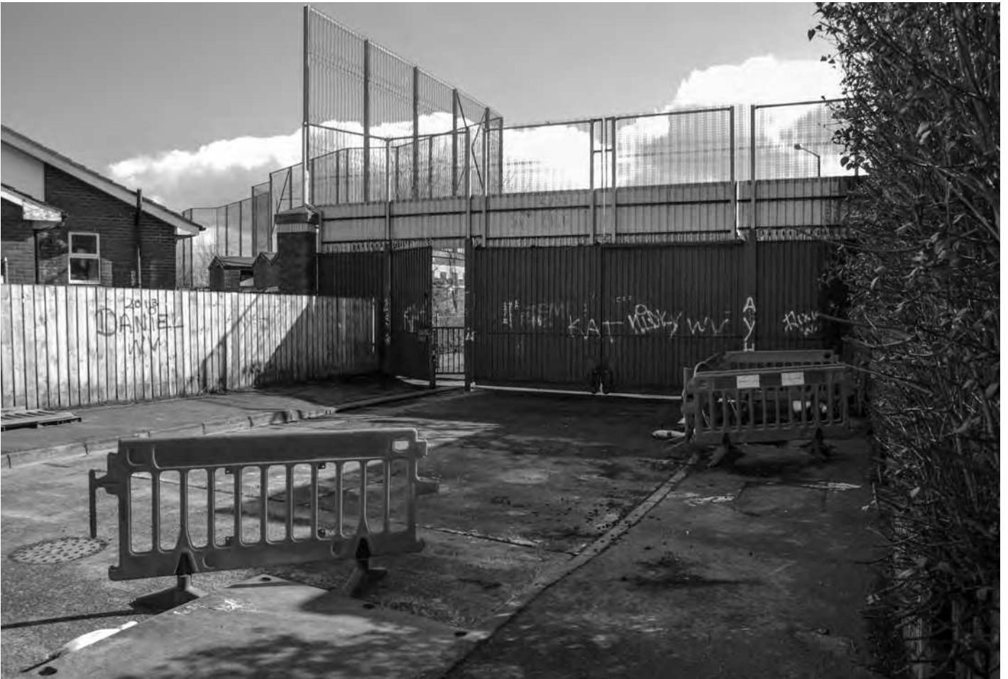
Photograph 9. Forthspring gate – Workman Road