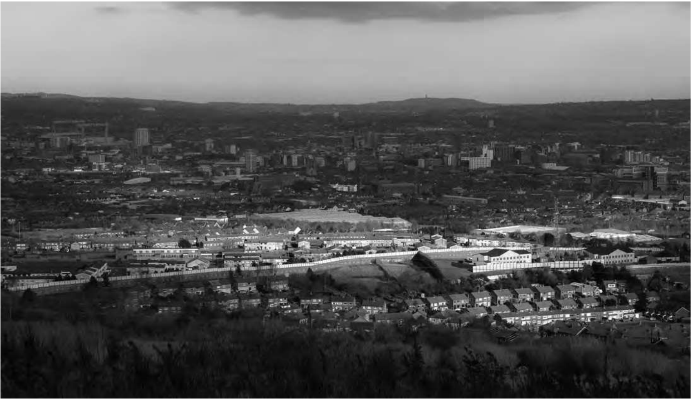
Photograph 4. Springmartin Road

West Belfast along the five miles between its origin at New Barnsley police compound, on the corner with Springfield Road, and its far junction with Ballygomartin Road at the foot of Black Mountain.