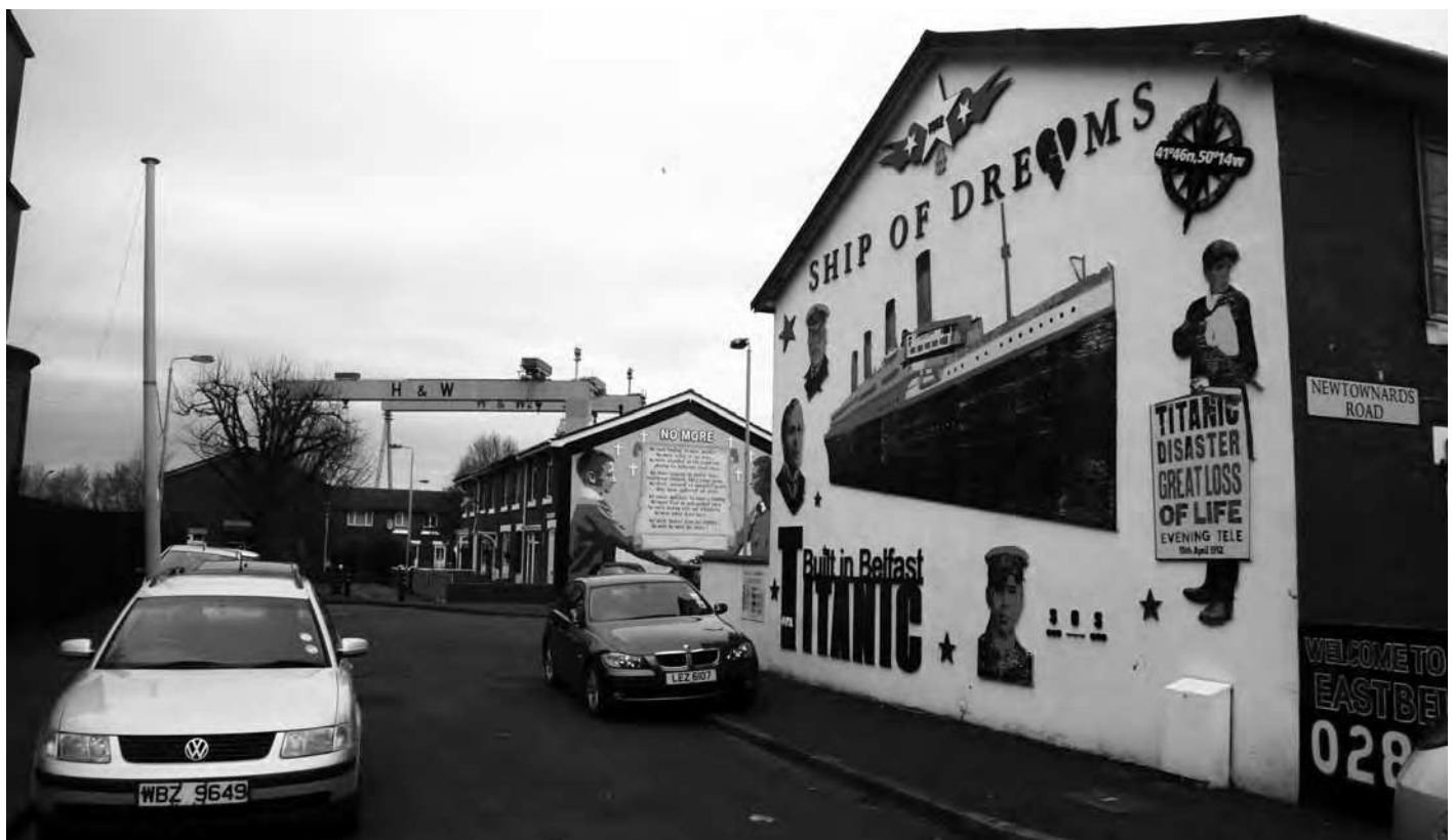
Photograph 18. Titanic no more – Short Strand