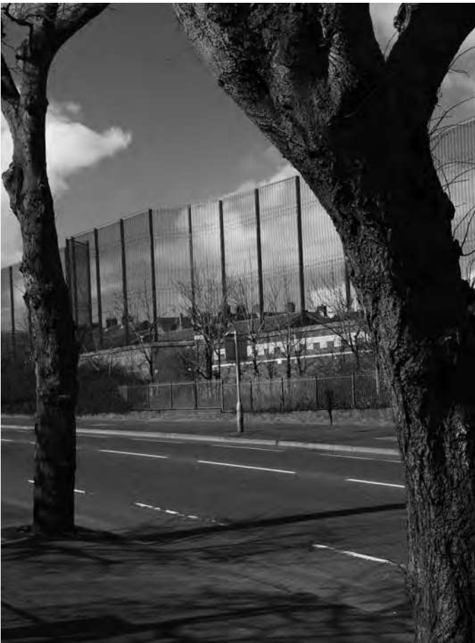
Photograph 5. Springfield Road

The wall here appears as a scar slashed across this part of the city. Elsewhere, functionality also predominates, as on Springfield Road (see Photograph 5) or Clondeboyne Gardens in Short Strand in East Belfast (see Photograph 6),