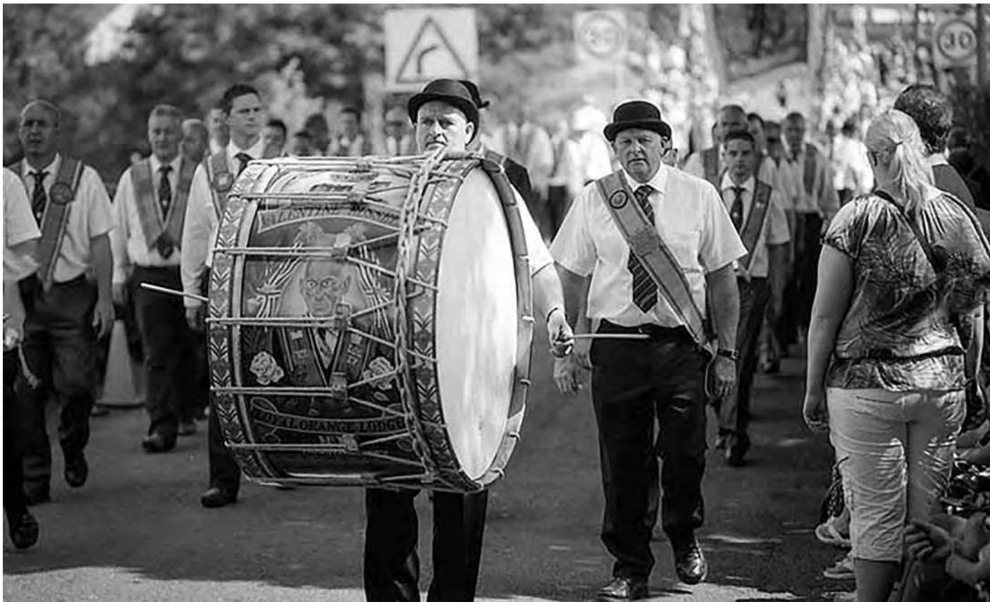
Photograph 22. Lambeg player at Newtownhamilton parade

band bass drum, and more technical to play. At up to 120dB it is also reputed to be the loudest drum in the world and can be heard up to six miles away when played outdoors, as it is in parades and some competitions. The ways in which the drum is constructed (with very high quality imported female goat skins), tensioned (with ropes, which takes two people), tuned (with hammers), and played (with canes) are unique to Ulster. Although according to Atkinson (n.d.) the drum was at one time used by Nationalist organization the Ancient Order of Hibernians this was discontinued as the drum came to function as a powerful and unmistakable symbol of the Protestant and Unionist communities who regard it as ‘the heartbeat of Ulster.’