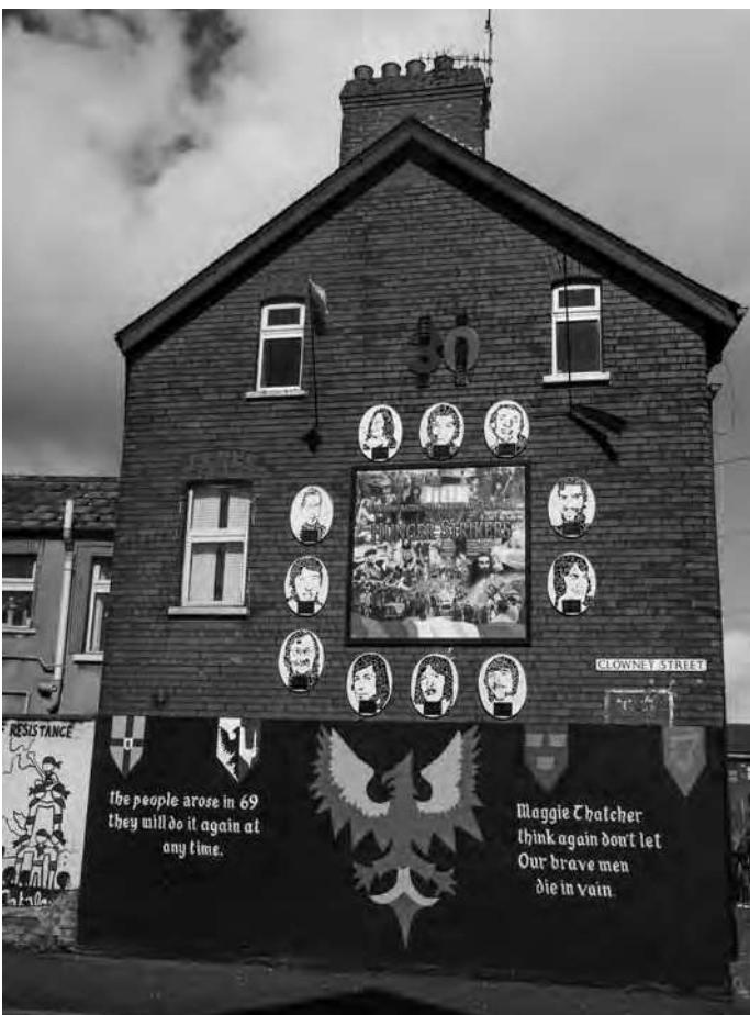
Photograph 11. Hunger strikers memorial mural Clowney Street

However, the style has since broadened even further to commemorating innocent victims, to drawing attention to suppressed issues (such as the continued use of plastic bullets – Photograph 17) and making connections to trade union issue, international political prisoners, and ultimately global peace. There are now murals commemorating Belfast