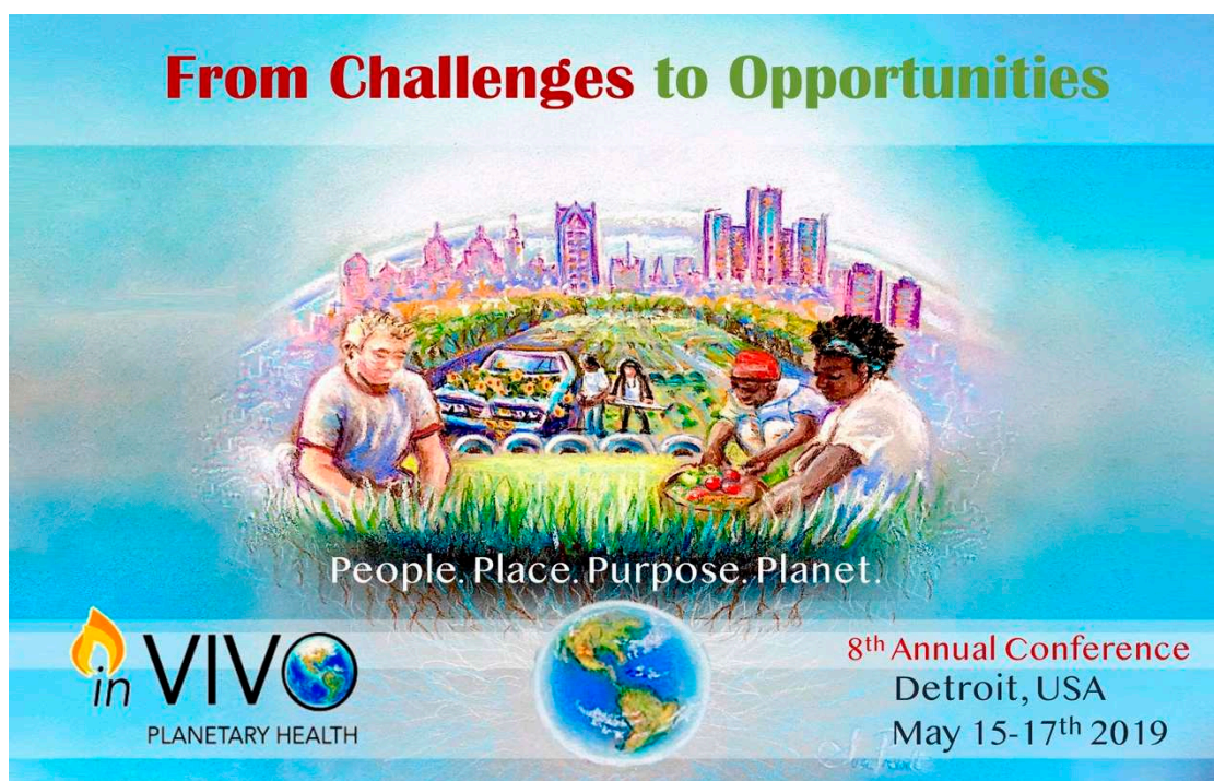
Figure 1. The theme of the 8th annual conference of inVIVO Planetary Health, held in Detroit, Michigan from 15–17 May, 2019 was “From Challenges, to Opportunities”.

The 8th annual conference of inVIVO Planetary Health (inVIVO), was held in Detroit, Michigan from 15 to 17 May, 2019. Our theme, “From Challenges, to Opportunities”, addressed the complex interdependent ecological challenges of advancing global urbanization and the impact on personal, environmental, economic, and societal health alike (Figure 1). Broadly, we discussed the multi-faceted dimensions of global ‘dysbiotic drift’ (life in distress) [1] on every level and explored strategies to overcome this.