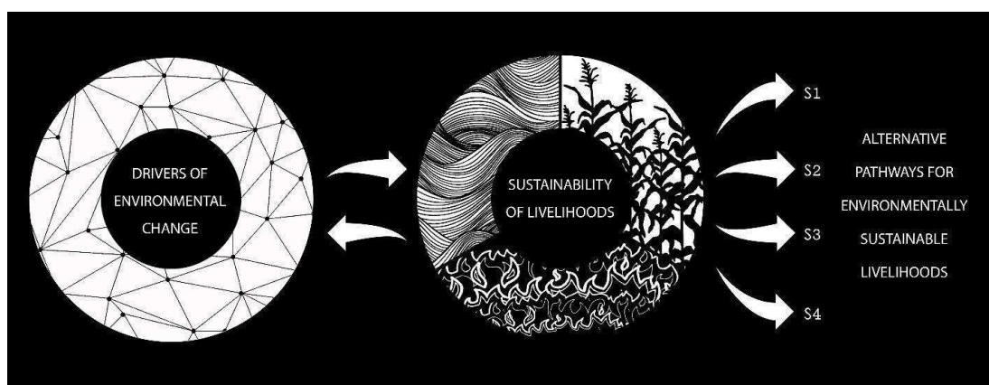
Figure 2. Schematic diagram representing the scenarios process using a water, energy and food nexus approach to explore the sustainability of livelihoods given identified drivers of environmental change.