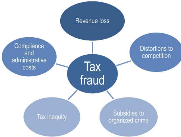
Figure 2. The costs of tax fraud

largely on revenue loss. However, as with other types of fraud, revenue loss – or transfer costs – is just one of the problems associated with VAT fraud. Generally, fraud costs can be disaggregated into various components: costs of preventing fraud (anticipatory costs), costs of responding to fraud, and negative externalities. 46 All are evident in VAT fraud, and in tax fraud more broadly. Apart from revenue loss, and as demonstrated in Figure 2, tax fraud gives rise to significant compliance and administrative costs for both tax administrations and businesses, and to significant negative spillovers: distortions to competition, tax inequity, and subsidies to organized crime. Some of these are new resource costs, rather than transfer costs, which have detrimental effects on economic welfare. 47