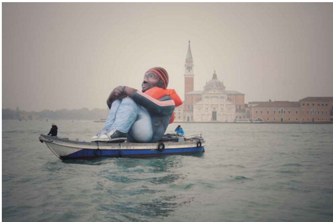
Figure 1. The entry of the Inflatable Refugee to Venice.

The Inflatable Refugee , self-funded by the collective, has been exhibited mostly for a couple of days across the waters of cities including Venice (Figure 1), Ostend (Figure 2), Copenhagen (Figure 3), Helsingor, Mechelen, Melbourne, Uppsala, Vejle and Breda. The artists based their site selections on a combination of place associations with the 'refugee crisis', local interests and practical considerations.