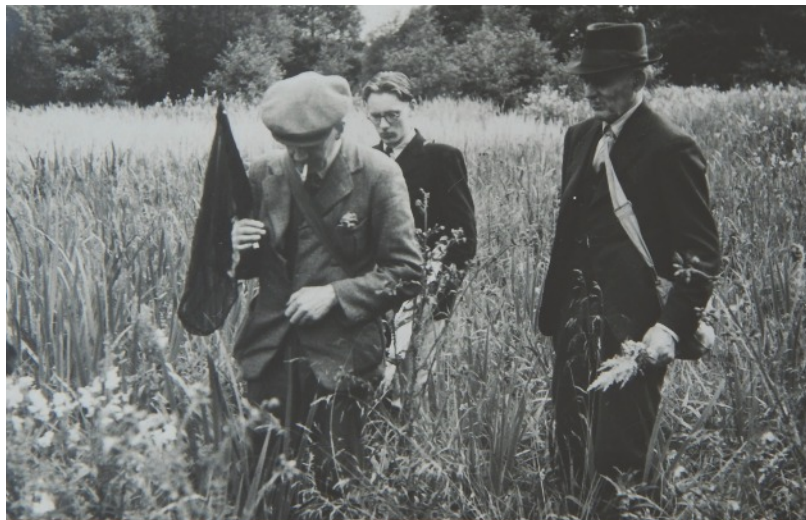
Figure 1. “Strensall Common” taken in 1944 by R.J. Batters, © Richard B. Walker. This view shows three entomologists engaged in daytime field collecting. During the Second World War, blackout regulations restricted night-time collection of Lepidoptera. Reproduced with permission from Richard B. Walker.

The Dark Bordered Beauty moth Epione vespertaria (Lepidoptera, Geometridae) is a Red Data Book species (Shirt, 1987), currently only known from a single English site, Strensall Common, about 10km north of York (Baker, 2012; Baker et al. , 2016). Publications mention Yorkshire as a locality for Dark Bordered Beauty in the 1820s (Stephens, 1829), York itself is mentioned by the 1860s (Walker, 1860) and specific sites around York are mentioned by the 1870s (Anon, 1878). Initially the most mentioned site was Sandburn (e.g. Porritt, 1883), along the Malton Road (A64), but later the adjacent site of Strensall (Figure 1), to the west of Sandburn, became better reported (e.g. Hewett, 1900). The moth was also collected at Askham Bog, to the south west of York in 1893 by S. Walker & R. Dutton, and again in 1898, but this fact was generally unrecognized until recently (Mayhew, 2018).