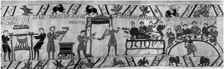
Figure 3: Scene from the Bayeux Tapestry, eleventh century, showing the Norman contingent cooking and dining; chickens, along with other meats, are being prepared on spits over the fire, and fish have been served at Bishop Odo of Bayeux's table

Similar arguments have been proposed to explain the ‘fish event horizon’, which saw large-scale marine fishing taking place across northern Europe, also around AD 1000. 58 The widespread rise in commercial fishing may also have been instigated by monasteries, where the first evidence for large-scale marine fishing is found. 59 In this way, neither an increase in fish consumption in the eleventh century, nor the increase in chicken frequencies seen on elite sites, can be seen as purely ‘Norman’ innovations; both trends were already present and developing independently in pre-Conquest England. That does not mean, however, that these trends were not influenced or accelerated by the Conquest. Given the Norman proclivity for ostentatious expressions of religiosity, most often seen through church building and monastic patronage, the post-Conquest secular elite may well have adopted the frequent consumption of both fish and chicken as a way to overtly demonstrate their piety. With this in mind, it is noteworthy that in the Norman dining scene on the Bayeux Tapestry, the assembled company are sitting down to a meal of fish and spit-roasted chickens (Fig. 3).