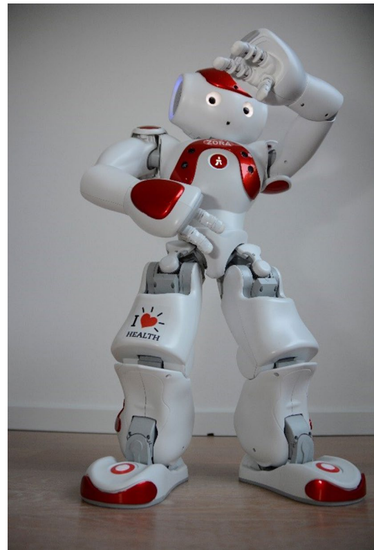
Fig. 1 Robot ZORA dancing

The study was performed in three facilities for children with severe physical disabilities in the Netherlands: two paediatric rehabilitation centres (which also offer special education facilities) and a school for special education (which also offers rehabilitation). The main researcher of the current study invited the professionals (therapists and special educators) to participate in this study. These professionals were selected by the head of their organisation, trying to select a mix of teachers and therapists from different disciplines. The invited therapists and special educators selected and invited children (via their parents) to participate in this study. The selection of children was done by convenience sampling, because the professionals selected children from their own therapy list or class, keeping in mind the in- and exclusion criteria of this study [13]. Inclusion criteria for children to participate in this study were: children with a severe physical disability (gross motor function classification system ranging from I to V), a developmental age between approximately 2 and 8 years, a chronological age between 2 and 18 years, and a stable cardiopulmonary status. Exclusion criteria were: epilepsy, deafness, blindness and severe aggressive behaviour. To ensure that all 3 studied domains (communication skills, cognitive skills and movement skills) were sufficiently represented in the goals of the