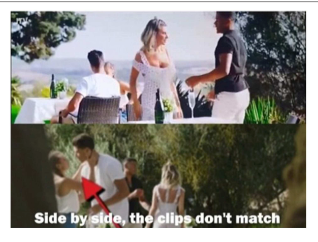
FIGURE 2 | Screenshot of edited video footage showing the kiss was filmed twice (Shadijanova, 2018). Used with copyright holder's permission.

The way in which race is represented in Reality TV has been a long-running area of concern (Orbe, 2008; Squires, 2008). Love Island has appeared to continue this uneasy trend, with