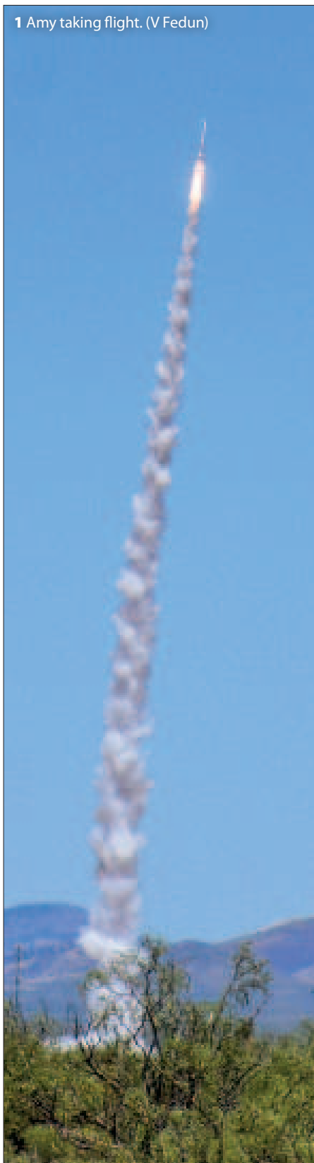
1 Amy taking flight. (V Fedun)

rules, the rocket had to reach the 10000 ft (~3048 m) mark within the smallest margin possible, while carrying a 4 kg payload – either scientific or non-functional.