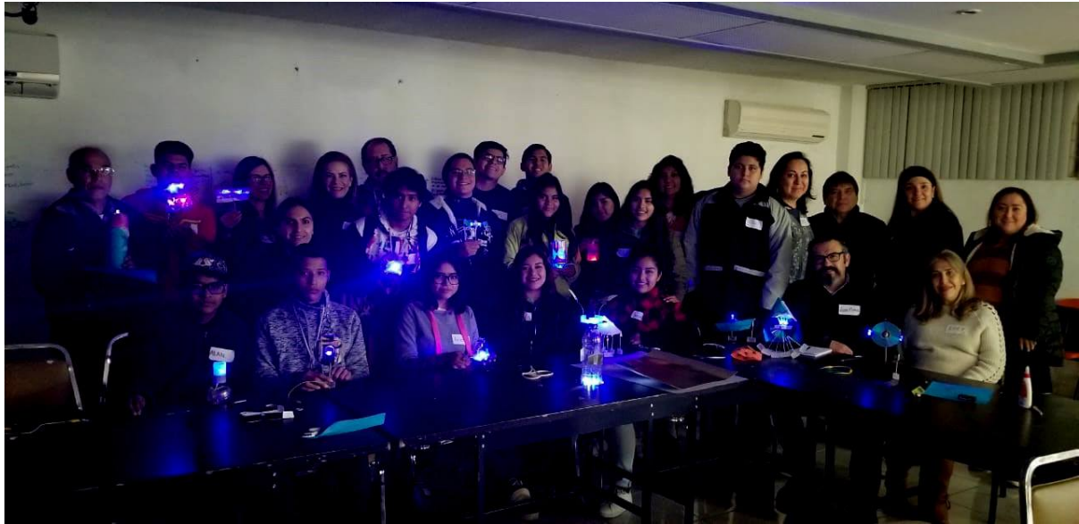
Figure 2 Workshop creating light objects with light diodes, batteries and found materials

In a preliminary workshop, the community's desires and ideas around the questions 'What do you make?' and 'What would you make?' were investigated and their contributions were categorised. Technical and creative making, and the sharing or selling of objects made were identified by the participants as key objectives for their engagement in the co-creation process. This response was tested with the community in a follow-up making workshop incorporating all these aspects, which asked participants to create a simple light-object from found materials and share a story around this object (Figure 2).