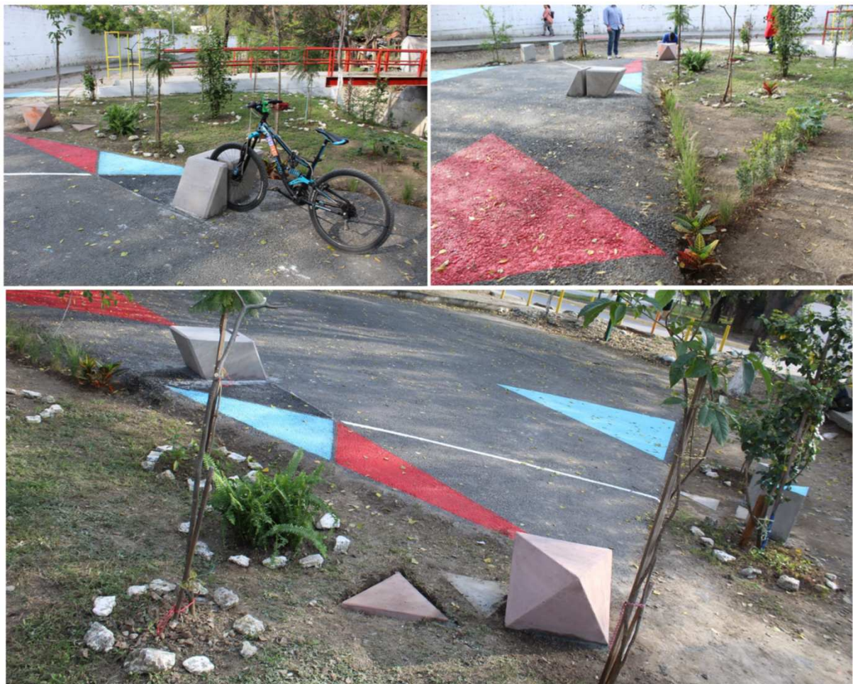
Figure 9 Digitally fabricated community urban furniture/public installation