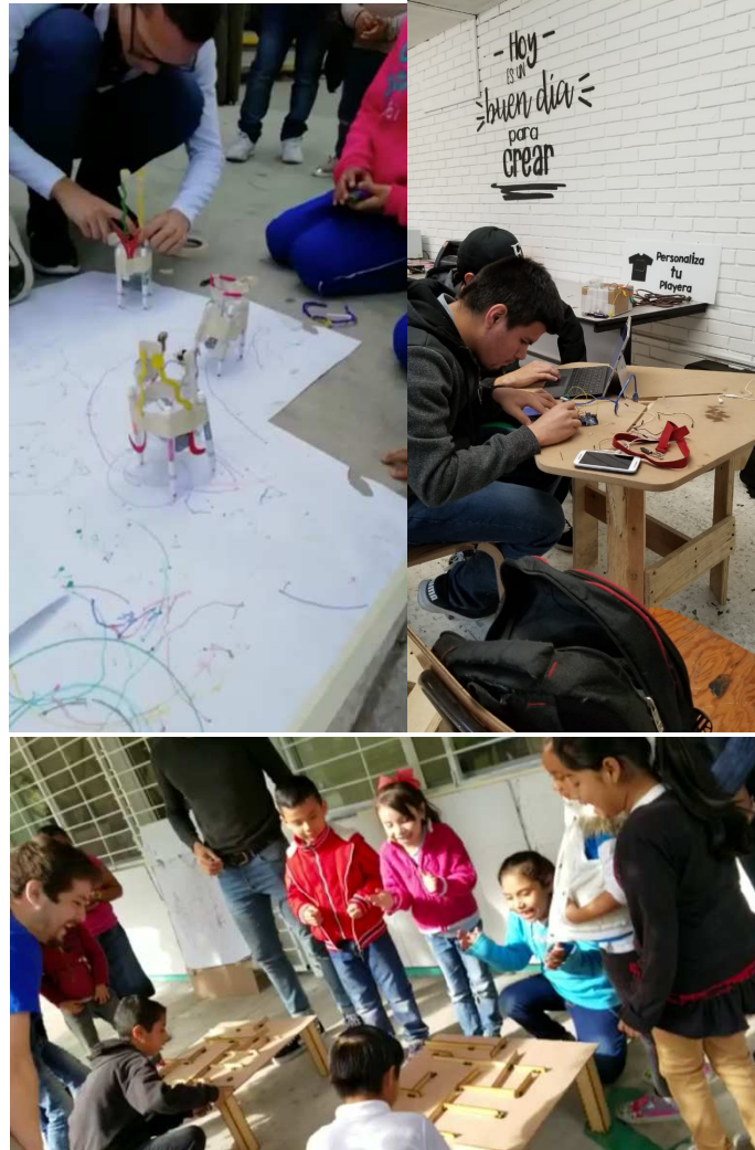
Figure 4 Fun inauguration activities for all ages