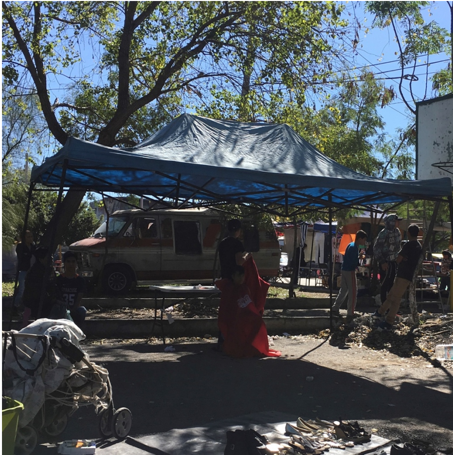
Figure 5 Youth is 'performing' a haircut in a public market, the setup of which is reminiscent of a stage with bystanders and waiting customers as audience

One of the most important activities in co-developing FabLab La Campana was the negotiation of a safe space to host it, to which the whole neighbourhood would have access. CBTis 99, a high school in the centre of the neighbourhood emerged as a key partner. Access to this space was negotiated between the host (CBTis 99), workshop facilitators (Tecnológico de Monterrey and FablatKids.org Mexico) and users of the space (CBTis 99 students and La Campana-Altamira). The negotiation of a suitable space in the high school resulted in the donation of a classroom that was transformed into a permanent Makerspace (Figure 6). A 3D printer was purchased and 10 Computers were donated by Tecnológico de Monterrey. The 3D printer and other maker tools were provided in a mobile Maker Cart, which was constructed by the Digital Fabrication team. Maker Carts are often used in educational settings (e.g. Peppler, 2013). Due to the flexibility of the Maker cart, which while mobile can also be secured, the equipment can also be used in other community spaces, e.g. the community social room or Sunday Market.