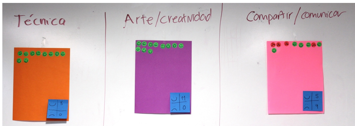
Figure 3 Participants' perception of Fab Lab core co-creation activities

Finally, participants were asked to rate their experience as positive (green dots) or not so pleasant (red dots) (Figure 3). The results were surprising and did not entirely correlate to the key objectives identified by participants during the preliminary workshop. Technical and creative making was seen very positively, but the communication of what had been made, the sharing of ideas and teamwork were only seen as desirable activities by half of the participants.