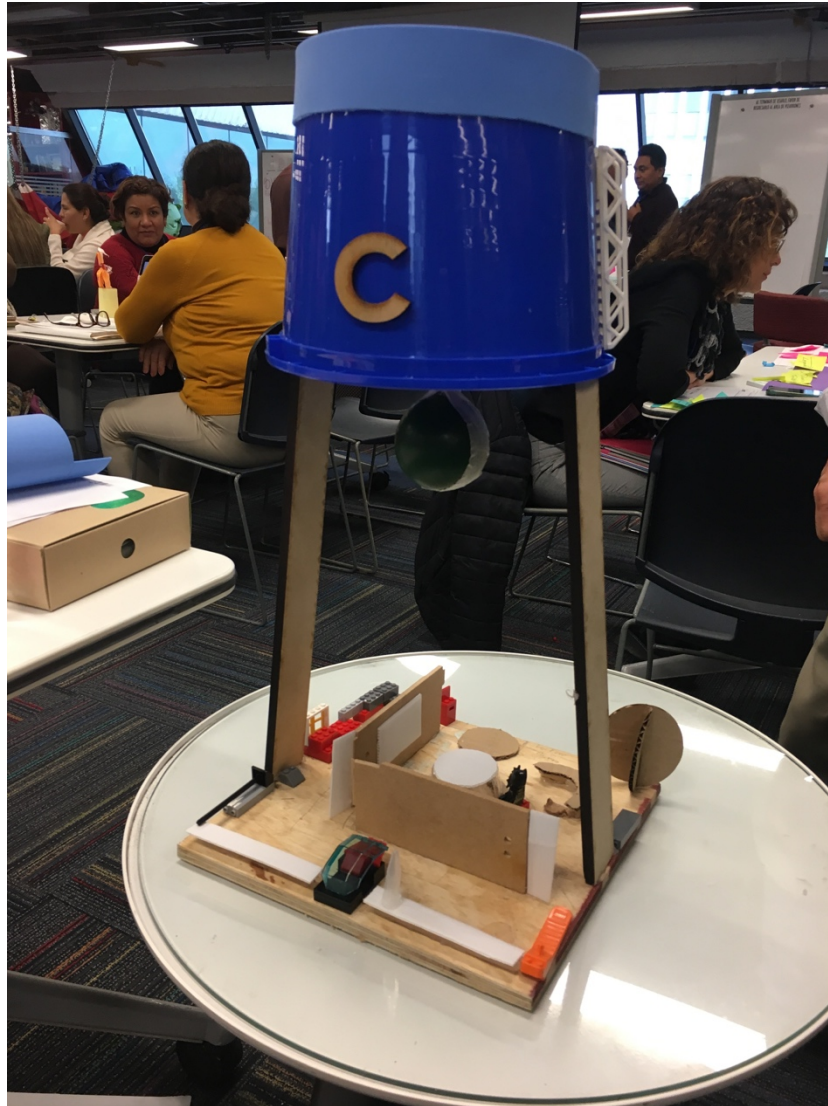
Figure 1 Prototype for La Campana (The Bell) FabLab in 2018

Building on a unique partnership between higher education and secondary education institutions as well as the local community and maker networks, this idea was developed into a proposal for a follow-up project and funded in 2019. The aims of the project were to: