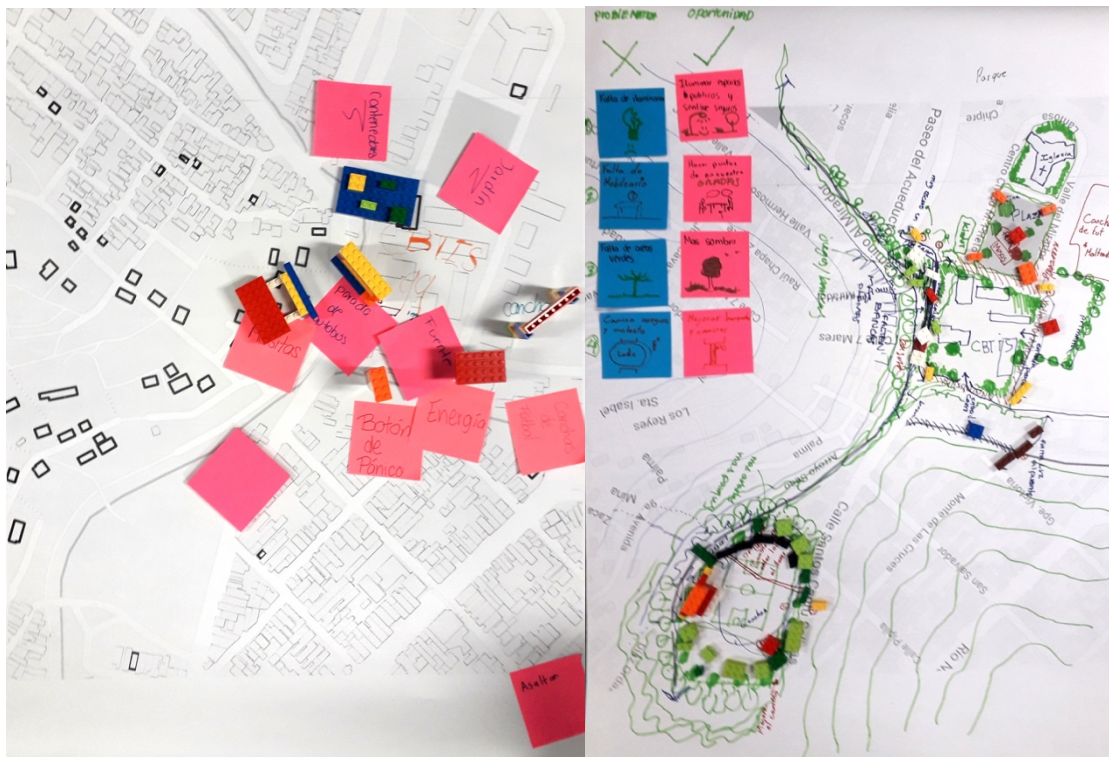
Figure 7 Community maps showing desirable and undesirable areas and potential interventions

Interviews, observations and community mapping activities of the urban and social context of the area have shown ‘unsafe spaces’ that facilitate anti-social behaviours (e.g. drug crime and violence, mugging, assault and illegal dumping) but also spaces that the community would simply like to use more or in a different way (e.g. a sports playing field that floods easily). Examples of community maps are shown in Figure 7 and a summary of key places for potential interventions are summarised in Figure 8.