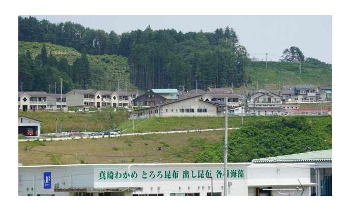
Google Earth view (https://tinyurl.com/y3s7l5xp)