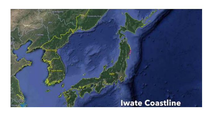
See the film here (https://tinyurl.com/y5wrj9dg).

Aerial view of Iwate's ria coastline, with significant settlements - Miyako, the long ria, small settlements, and main town - Ongoing reconstruction of residential zones & infrastructure - Kamaishi and its tsunami barrier - Rikuzentakata and its seawall - Reconstruction of Rikuzentakata - Zoom out.