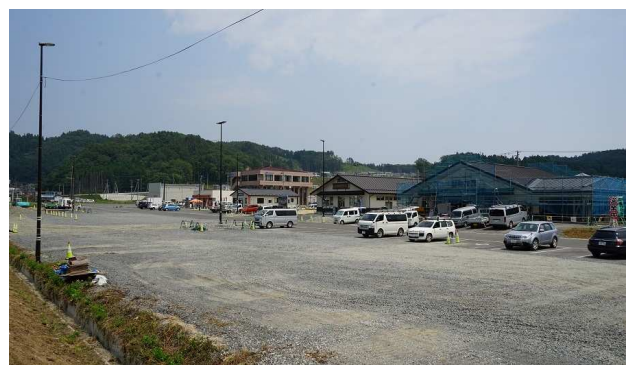
Google Earth view (https://tinyurl.com/y6rzny95)