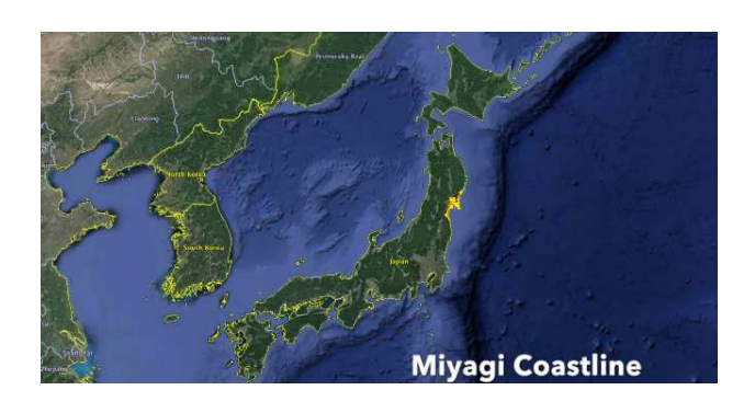
See the film here (https://tinyurl.com/y6kvamkc).