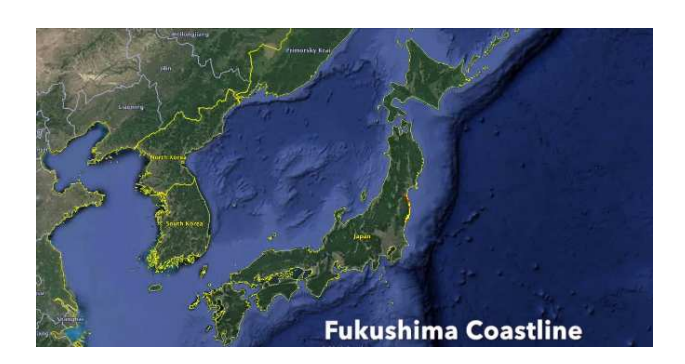
See the film here (https://tinyurl.com/y334jq5t).

Fukushima coastline - Long and straight with settlements separated by mountains -Minamisoma - Seawall - Namie & Futaba - Fukushima Daiichi Nuclear Power Plant - Okuma & Tomioka- Fukushima Daini NPP - Zoom out.