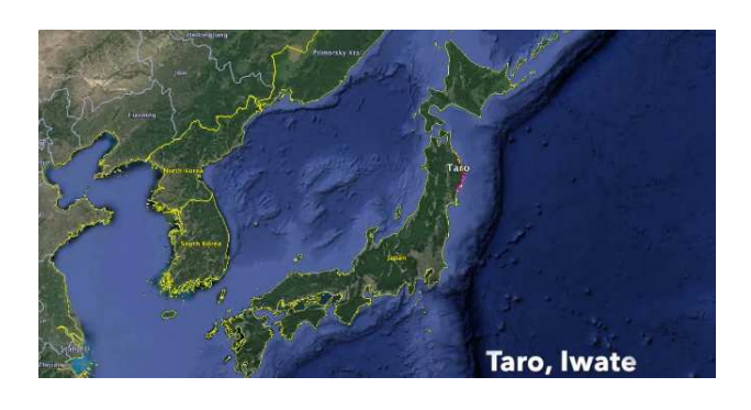
See the film here (https://tinyurl.com/y2es7ck6).

Tarō's location as a ria town on Iwate's coast - Coastal defences - Overview from various angles showing damage and reconstruction challenges - Main seawall - Port area - New residential zone - Agricultural, education, and industrial zones - Solar farm - Parks and amenities zone - Zoom out.