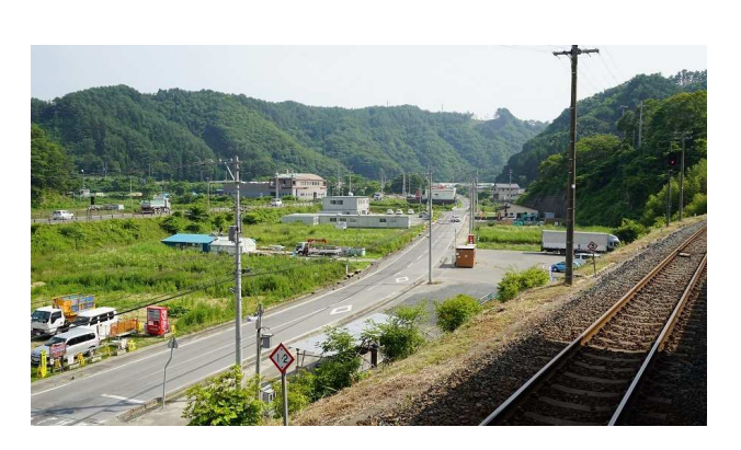
Google Earth view