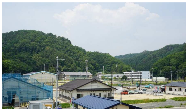
Google Earth view (https://tinyurl.com/y419ju8u)