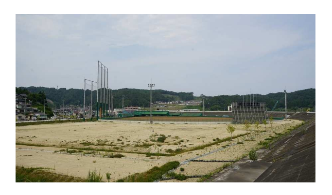
Google Earth view (https://tinyurl.com/y5zzo8b5)

Concrete seawalls are built for primary defence against storm surges, tsunami and coastal erosion, and may be used in conjunction with breakwaters, natural reefs, sand beaches, lagoons, forests, canals, levees, manmade banks, and road embankments (Tokida & Tanimoto, 2014; Koshimura et al, 2014). Builtup areas close to the coast often rely on a seawall alone, or a harbour with breakwaters. Tetrapods are also deployed either onshore or near-shore. Throughout Tohoku on 3/11, including Taro, each of these suffered damage or destruction (Mikami et al, 2012). Although Strusińska-Correia (2017) analyses the government's overall tsunami defence strategy for Tōhoku in great detail, including mention of Tarō, it is worth reviewing this issue before