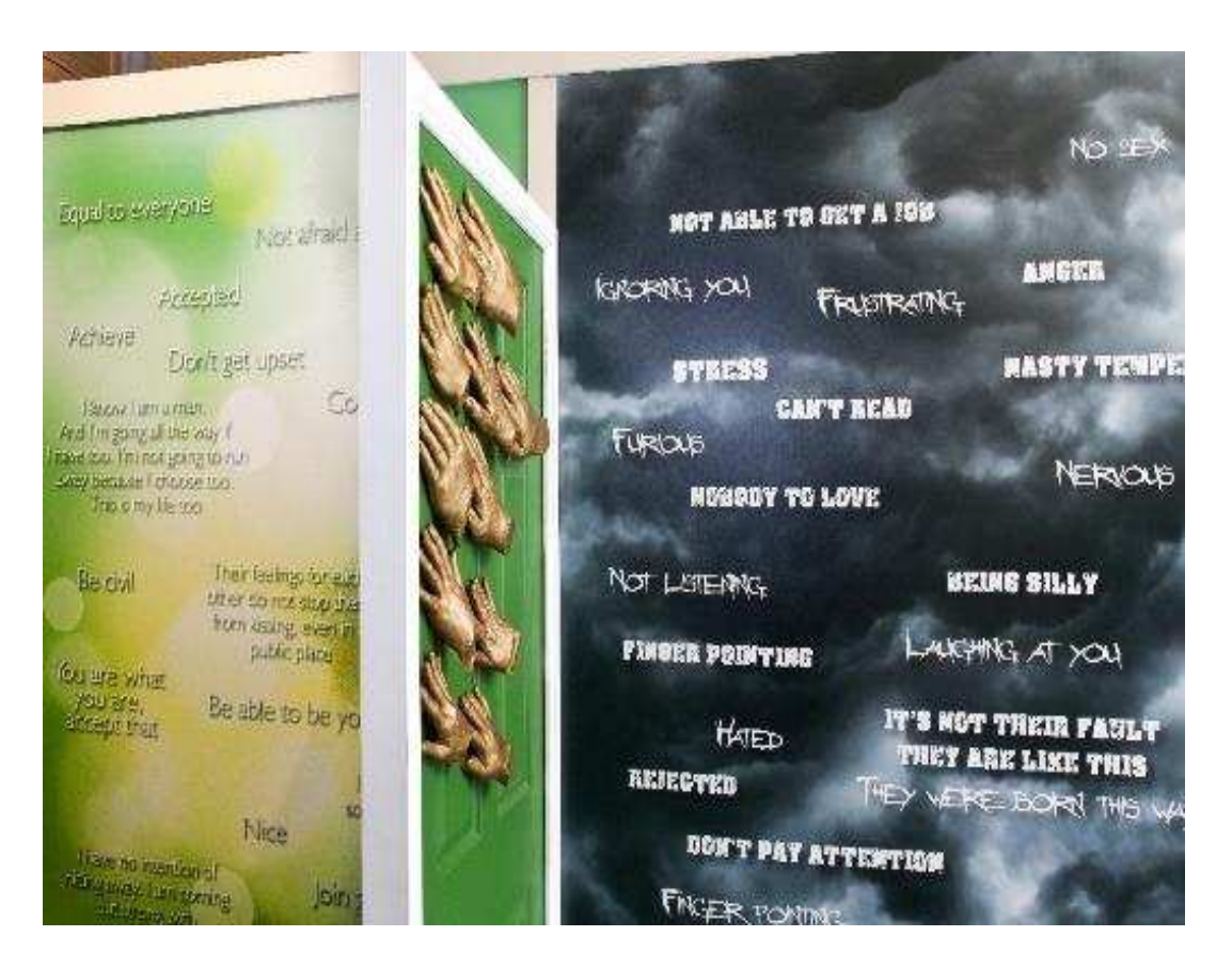
Figure 7 – The sculptured hands of the men trying to break down the barriers they face in society.

Whilst the forty-five workshops took place over the course of a year, the construction of the large sculpture in the community exhibition took place over four workshops. The artist associated with the museum had the initial idea of sculpting the men's hands, with the intention of gluing the hands against a door, giving an impression that the hands were trying to break the door down. The door symbolised a barrier that the men were trying to overcome, a metaphor for the barriers they faced in life. The men placed words on one side of the door, which reflected