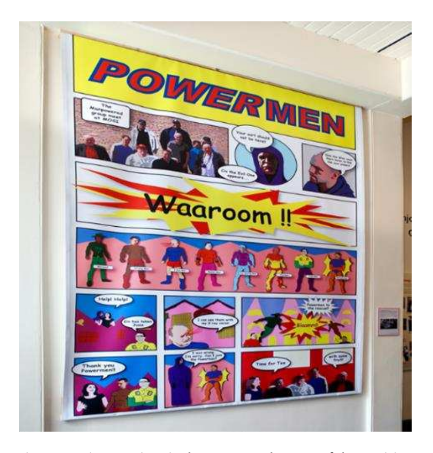
Figure 2 – Giant comic strip that presents the story of the participants superheroes saving the day.

Developing hobbies and skills with cameras