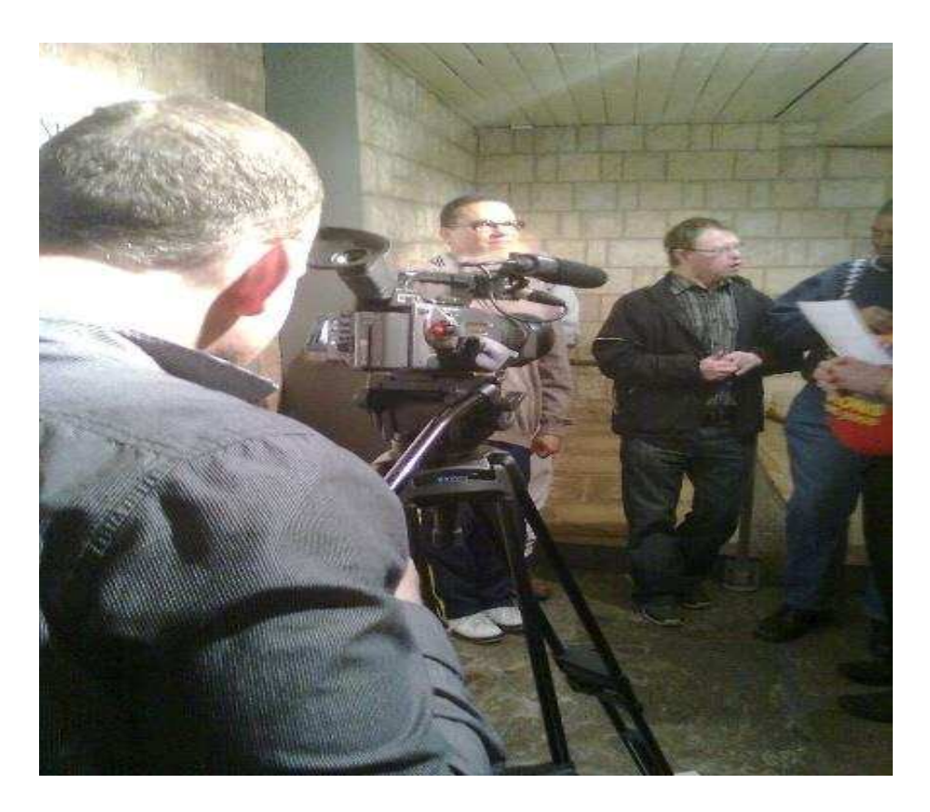
Figure 6 – Some of the men creating and filming a scene about 'being clean'.

For most of the participants, the main activity they wanted to participate in was drama, mostly improvised drama. This stemmed from their previous experiences of participating in projects where drama activities took place. The men, or the facilitator, would suggest a topic, whether it be related to health (talking about exercise, and acting this out in a scene at the gym) or whether they wanted to copy a scene from a film or television programme, and then they would act this out in a space, often with dialogue or mime. In one workshop, the topic of 'being clean' emerged because for many of the participants, having regular showers, washing clothes, smelling nice and having a good appearance was important to them. However, many of the men had experienced negative comments about their appearance and hygiene, and they wanted to convey some of those experiences through drama (see Figure 6).