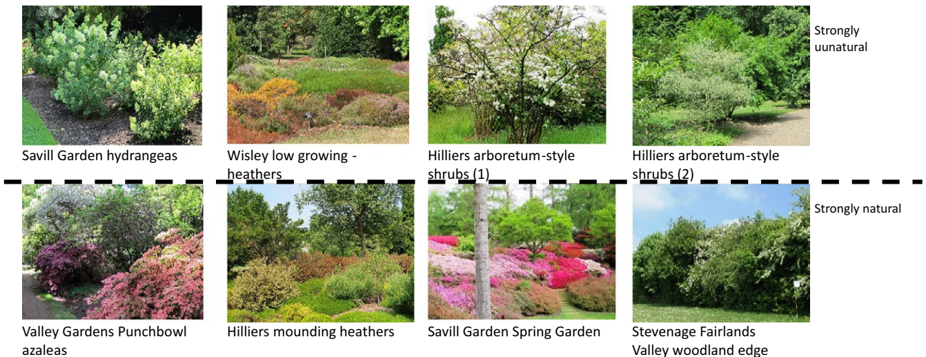
FIGURE 3 Images of the shrub sites used in the study, showing the two levels of planting structure: strongly unnatural and strongly natural

other species, resulting from deliberate planting or placement. In the case of woodland (Figure 2) and herbaceous (Figure 4) planting all three structures were represented. In the case of shrub planting (Figure 3), where diversity of form in designed green spaces is less varied, two were represented, with the