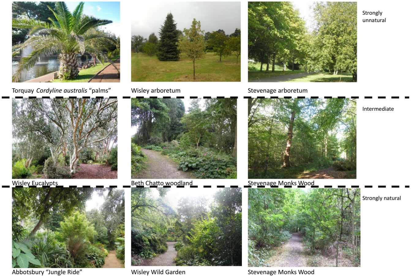
FIGURE 2 Images of the woodland sites used in the study, showing the gradient of planting structure from strongly unnatural to strongly natural