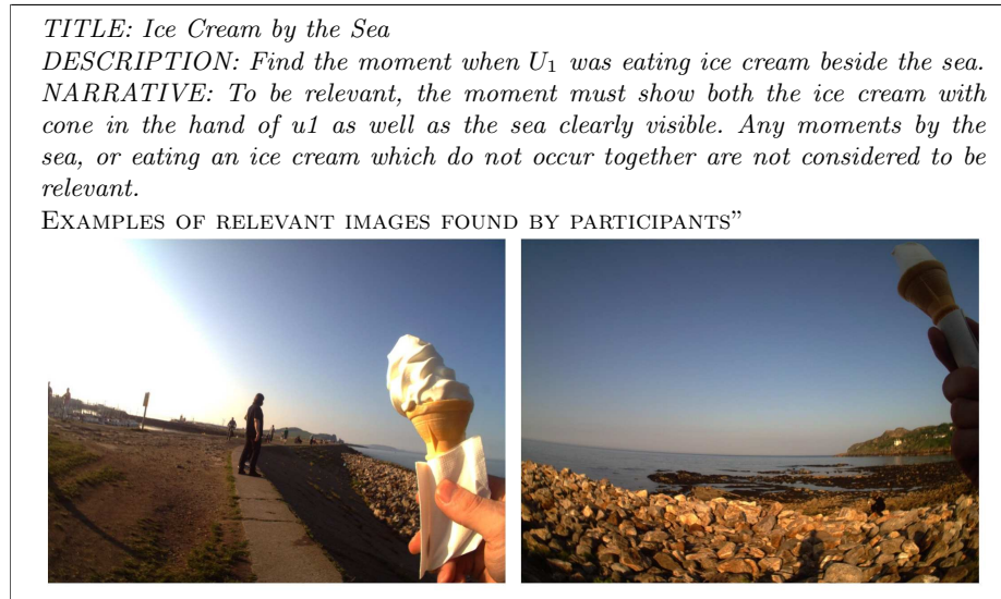
Fig. 2. LSAT topic example, including example results.