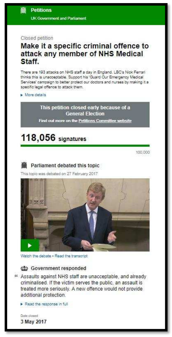
Figure 2: Webpage of an e-petition