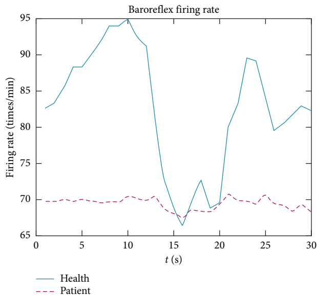
FIGURE 3: Baroreflex firing rate as a function of time. Results are shown from a healthy person (solid) and a hypertensive patient (dash).

independent of blood glucose levels in type 2 diabetic patients and that measurement of BRS may have the potential to predict CV events in consideration of GV.