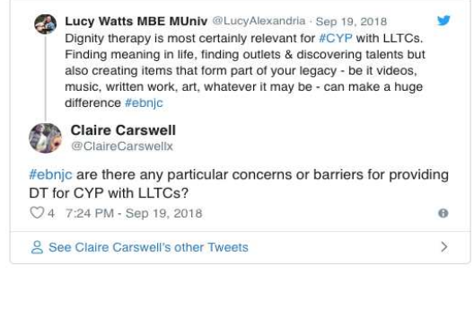
Figure 1: Valuing the individual

The chat involved a range of people from different backgrounds, who identified that DT is highly relevant for CYP with LLC but that therapeutic approaches must be tailored to the individual to meet their needs, wishes and hopes. CYP with palliative care needs are often involved, albeit to varying degrees, with their end of life care planning. There appears to be different approaches to this process and the extent to which the CYP feel that their voice is heard. DT could be aligned with the end of life care planning process, to move beyond consideration of clinical care pathways and thinking about wishes. An adapted DT, could assist professionals to explore with CYP their perceptions of the value in their lives lived so far and to think about what creative methods could be used to document their experiences. To this end, DT has the potential to make the CYP themselves feel valued and to enter a process that could be enriching and heighten perceptions of quality of life. A DT based intervention for CYP may also assist in meaning making, supporting family communication and enhancing perceptions of the self and purpose for the CYP. Figure 1 highlights some of views that were shared around valuing the individual.