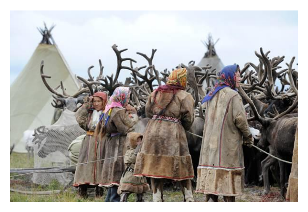
Figure 2: Shortage of space for the "Nenets" reindeer herders

are managed in increasingly smaller spaces through pasture reduction therefore dissimilarities in the 'representations of space' between the representatives from "the Nenets" and local government can be seen. These are based on competing understandings, meanings and values as well practices invested in the use and appropriation of space.