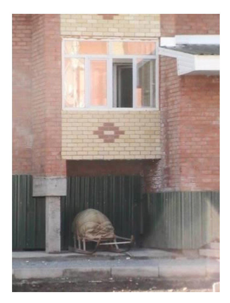
Figure 3: Sedentary life in the settlement

"This might mean the end of reindeer herding which, in turn, might lead to the fact that about 300 Nenets families will have to settle down. They will live in Yar-Sale or somewhere else and will start fishing" (R17).