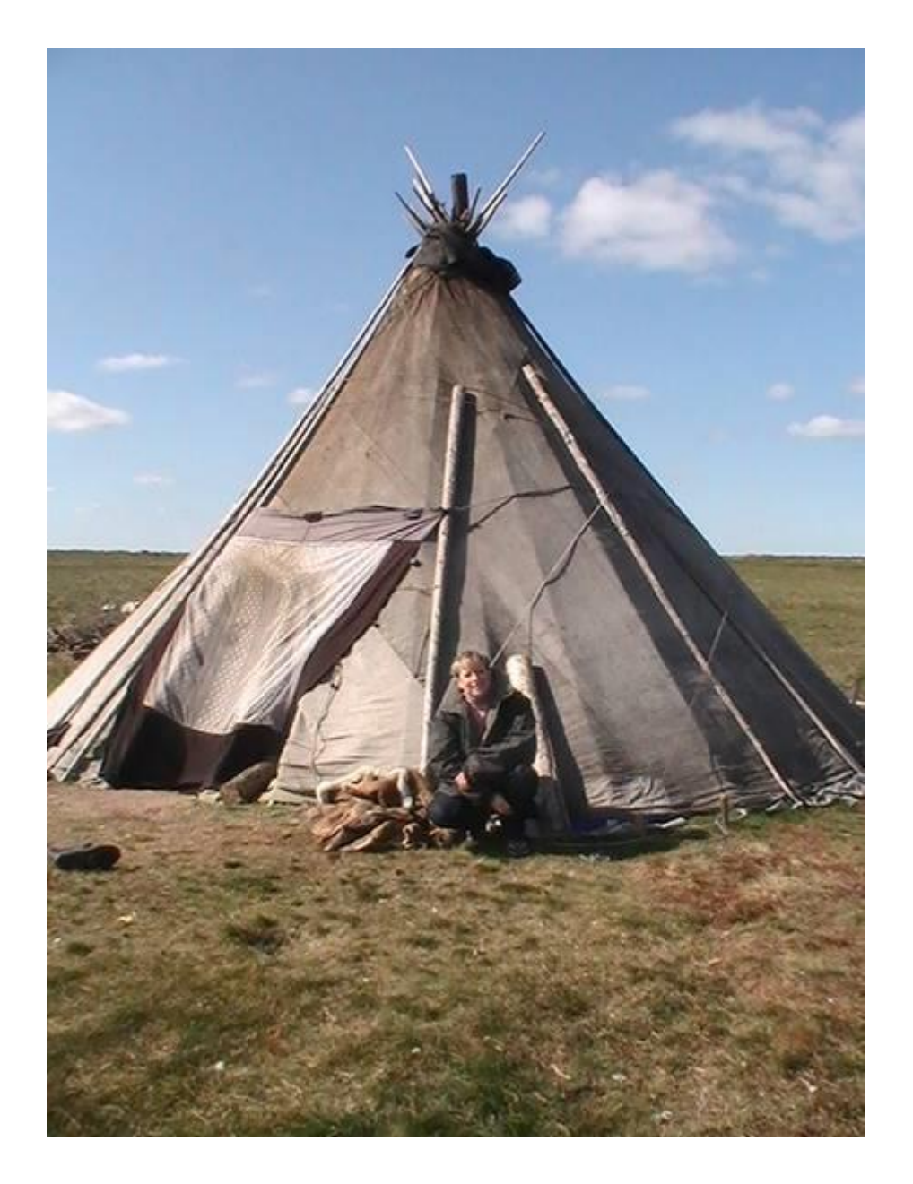
Figure 4: "The Nenets" participation in inbound tourism industry development

inbound tourism industry development (Figure 4). Here, the process of reoccupation illustrates Gaventa's notion of claimed/created spaces.