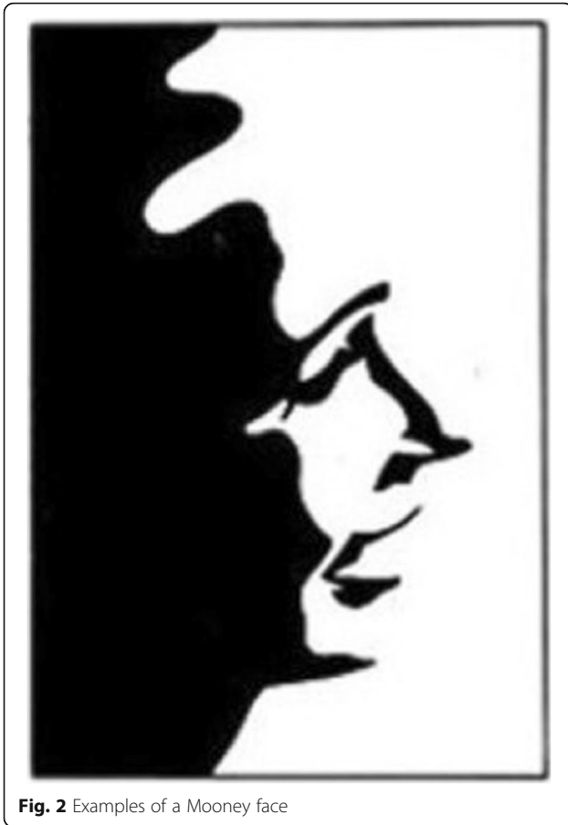
Fig. 2 Examples of a Mooney face

passage about 'France' and count the number of letter 'f's in the text. The aim was to create a parallel to the Face-detection Task that did not involve faces. The text passage was 300 words long and contained 50 'f's. Answers were scored in terms of the total number of letters correct. Participants were given 1 min to complete the task