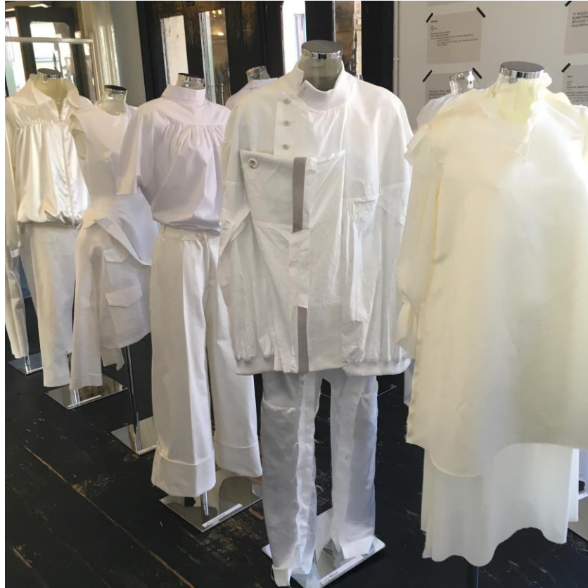
Figure 12. Finished garments from the White Vintage Collection 2018.