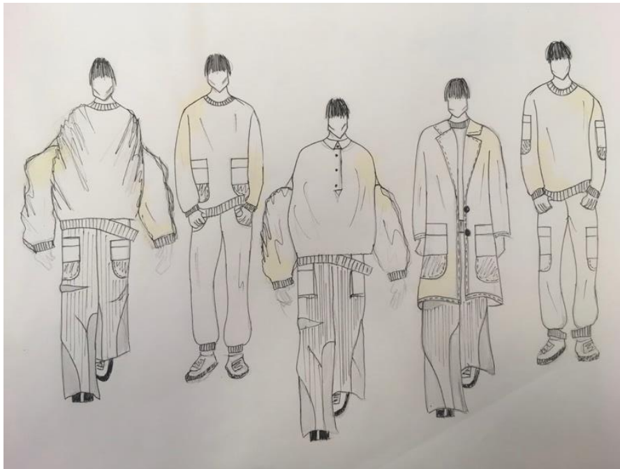
Figure 11. Mistake, menswear collection for Comme des Garçons by Isabella Pearson.