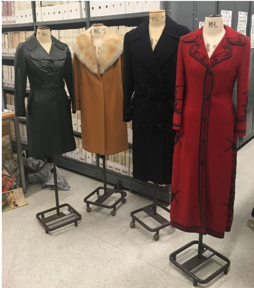
Figure 2. Vintage garments photographed in the Yorkshire Fashion Archive.

industry. The archive was employed in this study to identify mistakes in garment design and manufacture. This subsequently inspired the learning of the conceptual and technical skills used in garment creation discussed throughout the student's practice and in a questionnaire issued to the designers at the end of the project.