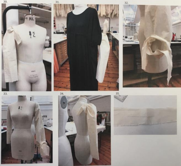
Figure 10. Mistake sleeve experiments.

The 'mistake' made here is stitching a sleeve into a straight line. Normally you would fit a sleeve into a curved line so you got a nice smooth finish. But for this project it is all about trying out different ideas that would normally be the wrong thing to do. Today in the studio, I experimented with a man's coat sleeve, fitting it into a straight line on a piece of calico. The end result was really interesting, as playing around with it on a male and female mannequin gave me inspiration in how this could be an exciting technique to use for this project. I then used the dress from the Yorkshire Fashion Archive and added my sleeve on to it, creating a really interesting outcome. It made the sleeve appear like it had dropped down to elbow length. Gathering ideas from this session helped me move forward with the project. I thought about the different fabrics that could be involved like a draping fabric for the main body and then using a heavy weight wool for the sleeves to create a structured piece. You can see the different stages of the process in the photographs on the right and also the photo of the sleeve added onto the archive garment. The silhouette that has been created is different and something people would look at it and think it is 'wrong' and shouldn't work. However the aim of this project, is to try out new ways of creating something even if it is a 'mistake'.