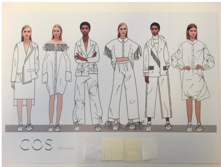
Figure 8. Mistake, womenswear collection for COS by Annabel Williams.

The second set of vintage garments are detailed in figure 9. They consisted of a man's coat in a brown wool check, double faced fabric, from the 1960s. This