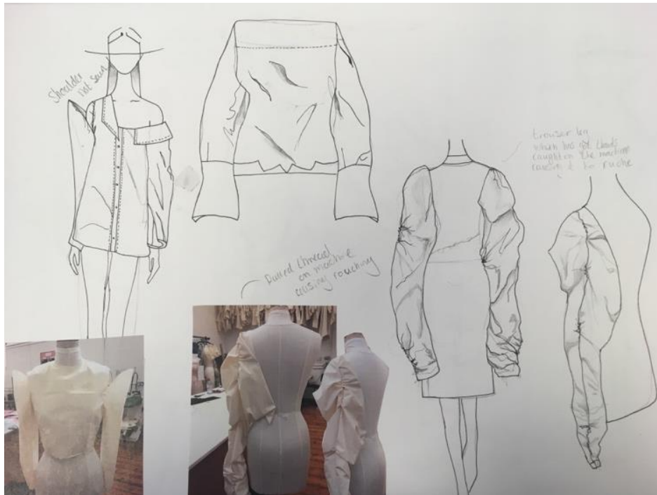
Figure 7. Ideas sketched from stand experiments.