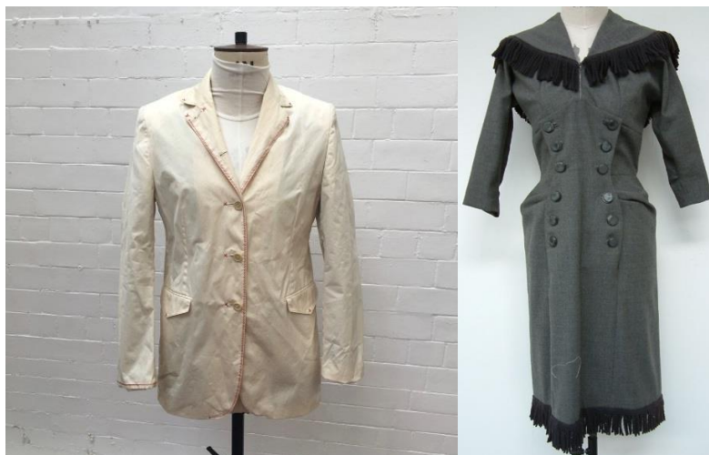
Figure 5. Holland Esq jacket c. 2000, Wool fringe dress c. 1945.

This section describes the results of the designer's journeys into mistake. It discusses the manufacturing blunders identified in the vintage pieces from the Yorkshire Fashion Archive and how they inspired garment creation. It should be noted that before allocation, each garment was carefully selected because it included construction mistakes for the designers to identify. Time in the fashion studio facilitated the designer's exploration of ideas through draping on the stand, exploring garment details and cuts and developing design and pattern ideas. These were recorded in sketchbooks through photographs and drawings used to inform the development of designs for the finished collection. The designers were each given a menswear garment and a womenswear garment. The male garments were more structured or tailored and the female garments were invariably more unstructured and in some cases home dress-made. This strategy permitted the study of different types of garments and the serendipity of mistakes identified within them proved to be interesting and varied. The two case studies discussed focus on two sets of the vintage garments.