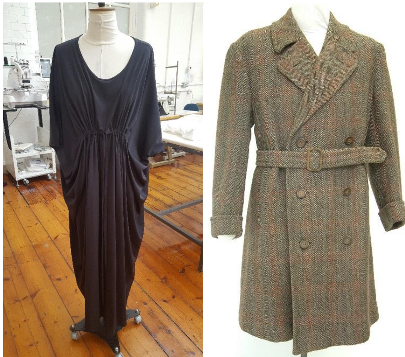
Figure 9. Black rayon jersey dress c. 1980s, men's coat c. 1960s.

was half-lined in a polyester satin. The dress was a shapeless garment with a drawstring at the waist. It was produced by a home dressmaker in the 1980s from an Issey Miyake pattern and manufactured in black, rayon jersey. The seams inside were not overlocked. The designer considered the use of pocket bags, (which were found to be unfinished on the coat) on the outside of garments, revealing their construction details and also began to experiment with sleeves placed below the natural armhole detailed in figure 10. When worn, the garment puckered up on the body creating a draped effect. The sleeve experiments show how the sleeve from the coat has been mocked up in calico and placed in incongruous positions on the dress. This led to further seam experiments inspired by the non-overlocked seams on the dress and how poor stitch tension created unintentional gathered effects. The ideas were sketched up in the white collection in figure 11 and the designer, Isabella Pearson selected Comme Des Garcons as her brand. The collection incorporated the use of frayed edge seams discovered on the dress, inside out pockets and the incongruous placement of sleeves below the natural armhole, creating drape effects. The designer also introduced a further element of mistake with the unfinished ribs on the sweatshirts.