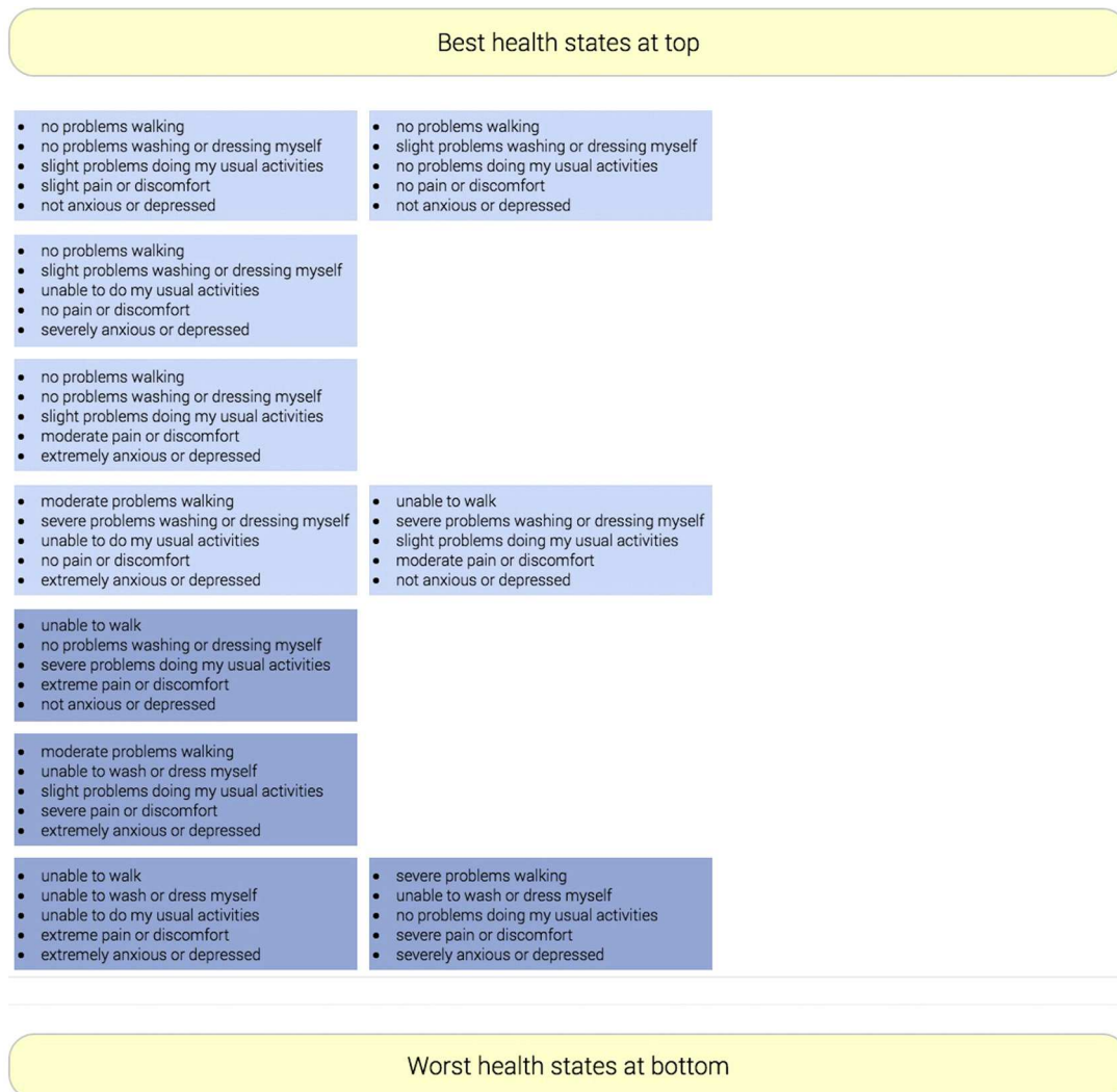
Fig. 2 – Example of feedback module in EQ-VT. EQ-VT indicates EuroQol Valuation Technology.

The research program provided no support for the other modifications tested: separation of the better and worse than dead task in cTTO, reintroduction of a ranking task for warm-up