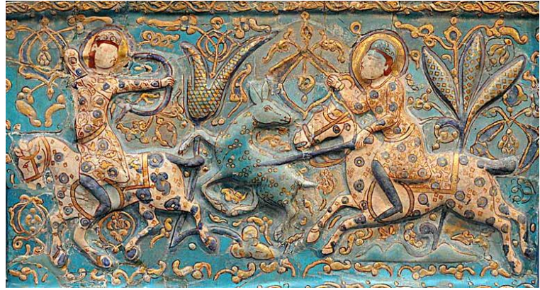
Fig. 9. Large mīnā'ī vase. Christies (L), and a relief mīnā'ī tile. Museum für Islamische Kunst, Berlin (R)