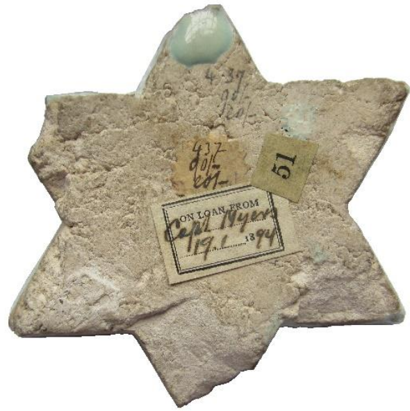
Fig. 3. Kilij Arslān II Kiosk, Konya (after F. Sarre, Der kiosk von Konia , Berlin, 1936 pl.1) (L), and the rear of a mīnā'ī tile. The Victoria and Albert Museum, London (R)