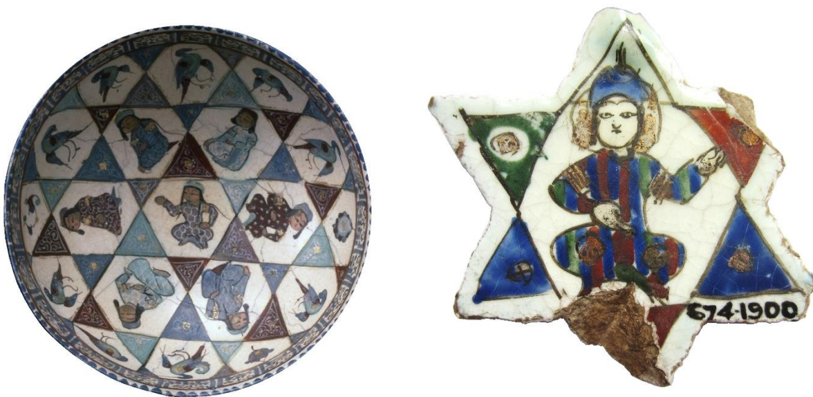
Fig. 8. Mīnā'ī bowl. David Collection, Copenhagen (L), and mīnā'ī tile from Konya. The Victoria and Albert Museum, London (R)