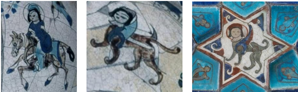
Fig. 7. Detail of horse and sphinx from a mīnā'ī bowl in the British Museum (1930,0719,63), British Museum, London (L), and a six-point mīnā'ī tile with sphinx from Konya. The Metropolitan Museum of Art, New York (R)