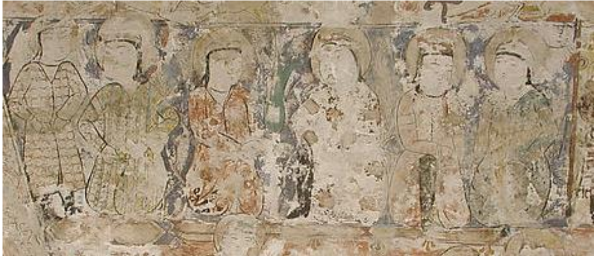
Fig. 1. Painted stucco wall panel (thirteenth century). The Metropolitan Museum of Art, New York