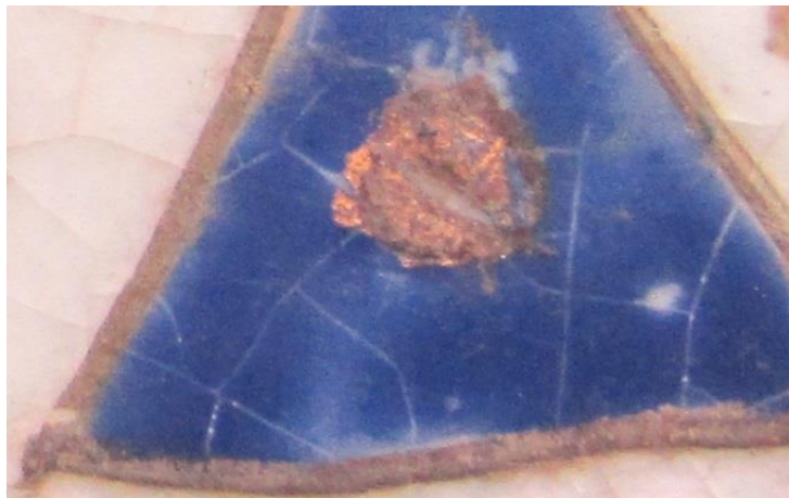
Fig. 2. Detail of mīnā'ī tile. The Victoria and Albert Museum, London