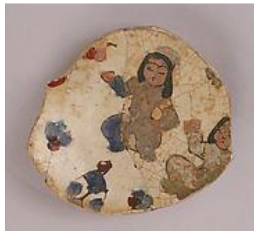
Fig. 5. Mīnā'ī vessel sherd, excavated in Merv, Turkmenistan. The Ancient Merv Project (L), and two re-joined mīnā'ī sherds showing different levels of colour loss. The Metropolitan Museum of Art, New York (R)