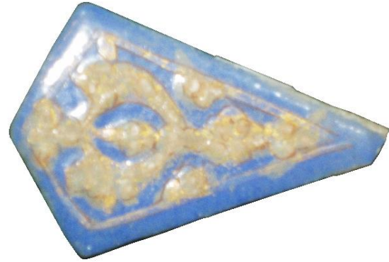
Fig. 4. Mīnā'ī tile fragments, excavated in Kunya Urgench, Turkmenistan