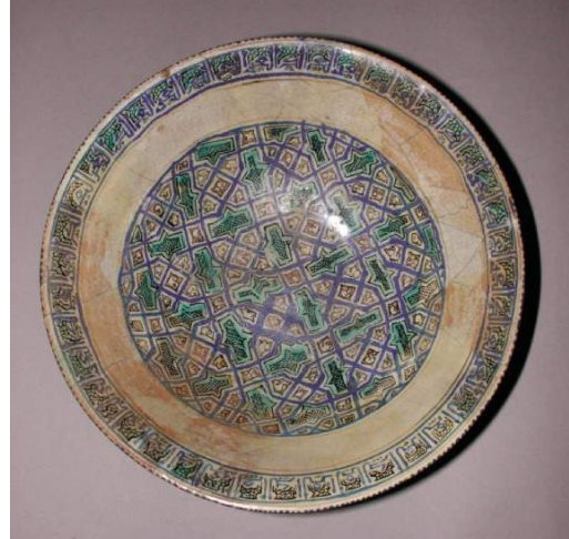
Fig. 10. Mīnā'ī sherd featuring tile-like patterns. The Metropolitan Museum, New York (L), and a mīnā'ī bowl with a different variation of tile-like decoration. Fitzwilliam Museum, Cambridge (R)