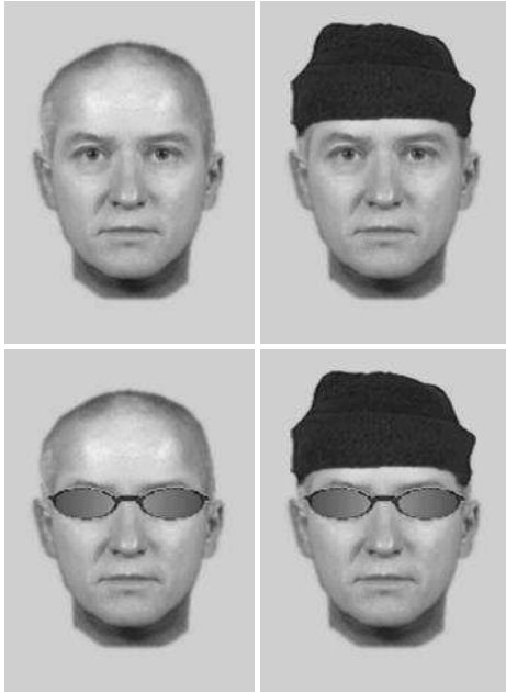
Fig. 3. Example composite constructed from memory by a participant in Experiment 3 of EastEnders' character Alfie Moon (played by actor Shane Richie), top left, and different representations, edited with selective concealments (woolly hat and sunglasses). Images were presented together as an array. In this example, the composite constructor initially saw a target photograph with inaccurate hair (a bald head in this case).