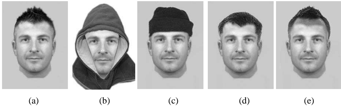
Fig. 2. Example whole-face composites used in the spontaneous-naming task in Experiment 2. Composite (a) was constructed from a target photograph of John Terry in Experiment 1, Stage 1; it is the same image of Fig. 1, far left, after the constructor had added hair. For Experiment 2, this composite was edited to create another composite image, wearing: (b) hooded top, (c) woolly hat, (d) hair from another composite in this set and (e) 'exact' hair (copied from the footballer's target photograph). The target photographs were manipulated in the exact same way and presented to participants to name after they had attempted to name the composites.