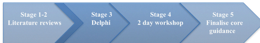
Fig. 1 DELTA2 project components of work