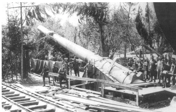
35cm Austro-Hungarian naval cannons on the Italian front, 1916.

I had gone to no such place but to the smoke cafes and nights when the room whirled and you needed to look at the wall to make it stop, [...] and the world all unreal in the dark and so exciting that you must resume again unknowing and not caring in the night, sure that this was all and all and all and not caring. Suddenly to care very much and to sleep to wake with it sometimes morning and all that had been there gone and everything sharp and hard and clear and sometimes a dispute about the cost (13).