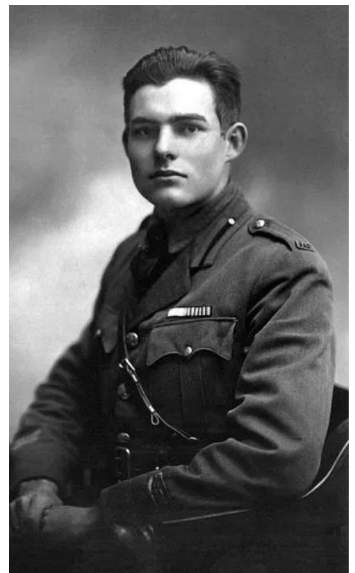
Ernest Hemingway in his military uniform in Milan, Italy, 1918, where, like his character Frederic Henry, he served as an ambulance driver.