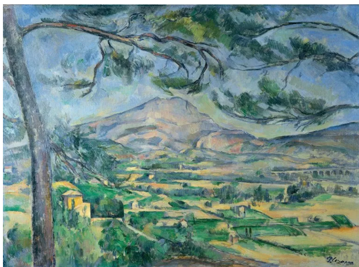
Aestheticised Landscapes: Mont Sainte-Victoire with Large Pine (c. 1887), by Paul Cézanne

[...] borrowed at least four methods from Cézanne for landscape descriptions: the use of a series of planes often cut across by a diagonal line, the careful delineation of even the most distant mountains and ridges, the emphasis upon volumes of space with the use of simple geometrical forms as the basis of definition, and the occasional use of colour modulation (40).