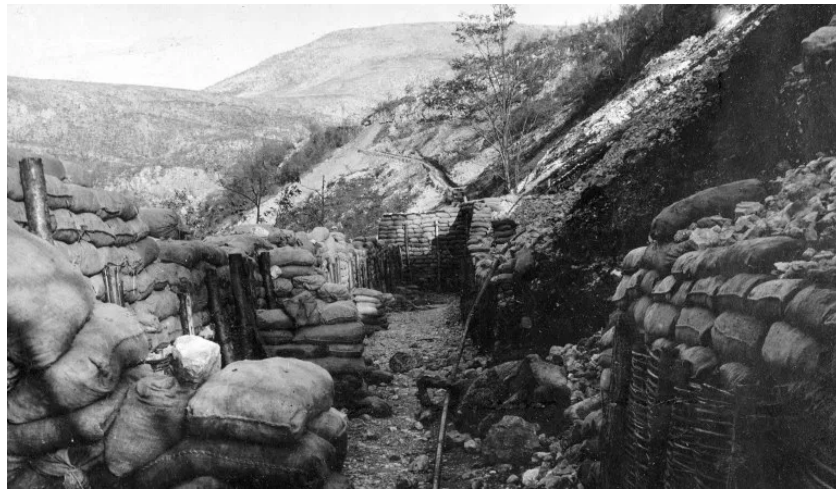
Trenches at Monte San Gabriele (Skabrijel) along the Italian front, 1917.