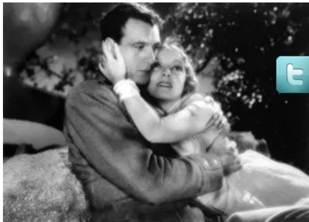
Territorialised landscapes: Gary Cooper and Helen Hayes in A Farewell to Arms (1932), a film adaptation of Hemingway's novel that focused on the romance narrative.