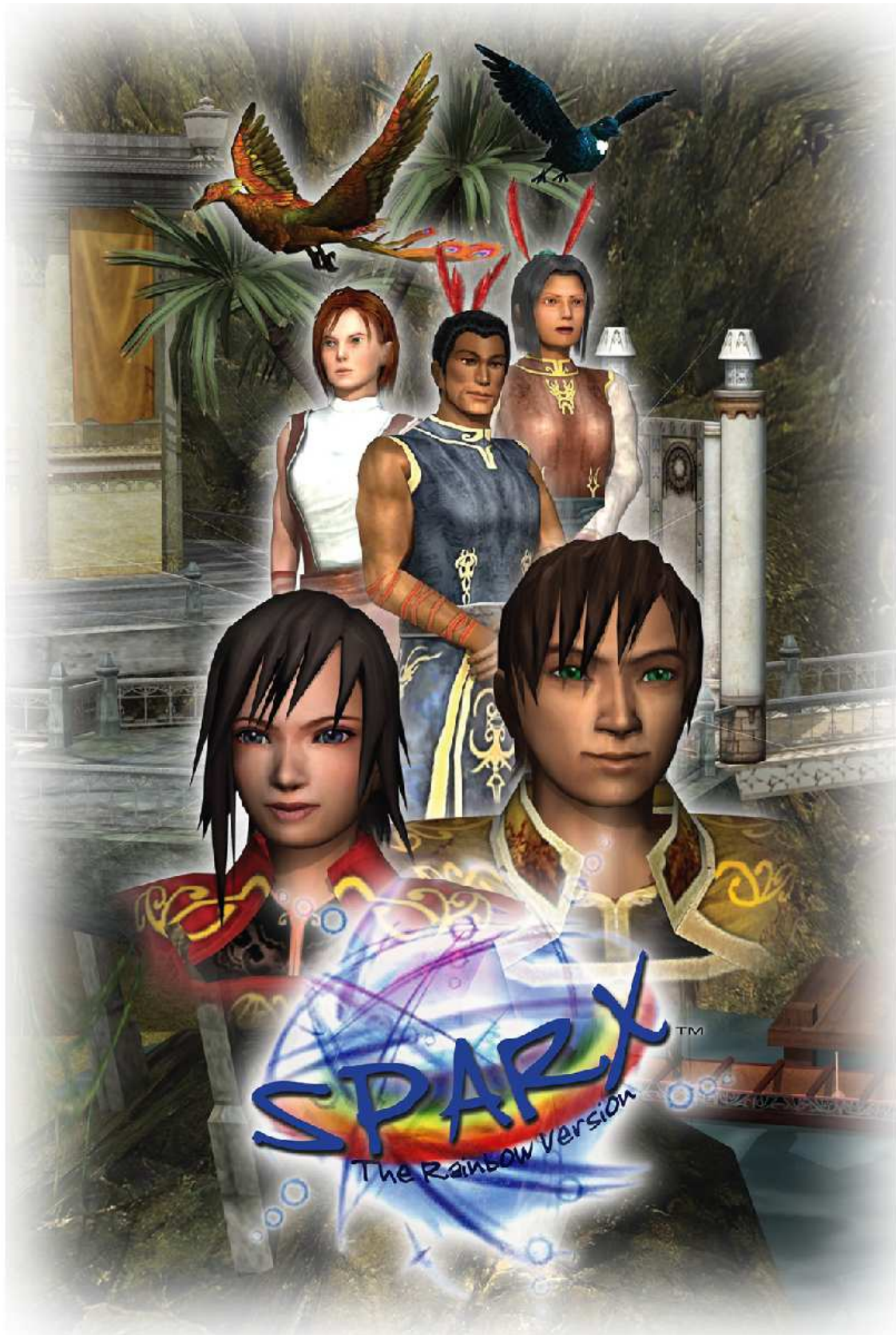
Figure 1. Rainbow SPARX image. SPARX: Smart, Positive, Active, Realistic, X-factor thoughts.