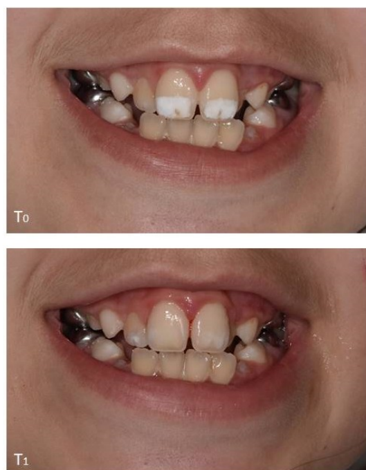
Figure 1. Clinical images to show the appearance of a 'typical' participant's permanent central maxillary incisors before ( T_0 ) and one-month after ( T_1 ) treatment (microabrasion followed by resin infiltration).

Standard clinical photographs were acquired of children's anterior teeth before any treatment at baseline ( T_0 ) and at one-month review ( T_1 ) using a digital SLR camera (Nikon D3400, Nikon UK Ltd., Kingston upon Thames, UK) equipped with a Sigma EM 140DG macro ring flash (Sigma Imaging (UK) Ltd., Welwyn Garden City, UK) and Tamron 90 mm macro lens (TAMRON Europe GmbH, Berkshire, UK). These clinical images were taken at standardised settings (ISO 100, 1/160 speed and F/22 aperture), distance (about 20 cm between operator and the patient), and natural and room illumination conditions. Some examples of these are shown in Figure 1. Images were stored electronically as part of the patients' dental records.