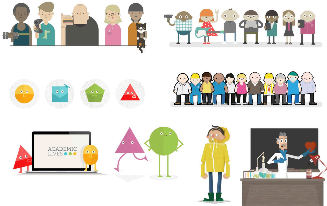
Figure 1 Character design options.

familiarisation, followed by line-by-line coding to identify recurring ideas and organising these into themes and subthemes. We also compared interviews across participant groups to identify similarities and differences. Analysis was undertaken by JMM-K with guidance provided via regular meetings with BY and KA to discuss transcripts and aid data interpretation. As we outline below, findings from the data analysis were also discussed with the TRECA Study Patient and Parent Advisory Group to seek their thoughts on ways to implement feedback received from the qualitative study in the development of the multimedia websites. Data coding and indexing was assisted by Microsoft Excel 2010 software. JMM-K drafted several iterations of a data analysis report, which BY, KA and PK read and discussed.