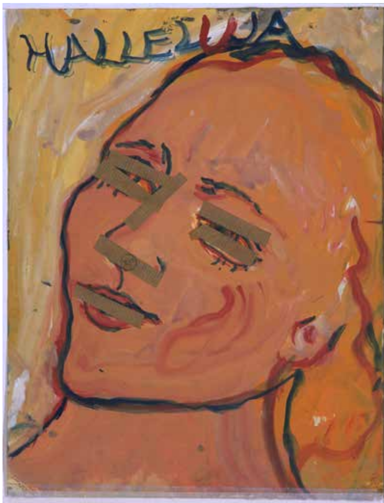
Figure 1. Charlotte Salomon, Paulinka Bimbam singing Halleluja. Excluded and defaced painting.

supplementary logic of their relations. This involved imagining when each was made. I think the Main Part (the work has three elements: a prologue, a main part, and an epilogue)—which has the majority of paintings CS later found supplementary, that is, that could be sacrificed to create the epilogue for instance—was the core of the project and hours were spent by the artist detailing every conversation and reflection of the two characters Amadeus Daberlohn and Paulinka Bimbam . I did discover that there were thematic or analytical relations between the works selected to be turned over and those re-used in another part of the project. So, it is as if there is a hidden commentary, a silent joke, a witty addition, if we could lay them all out. Yet the fact of having to turn a painting over, of creating two-sided images, is itself fascinating, as we ponder how she imagined a reader and why she placed certain images on the reverse. This is what made me choose for my cover an image of the avatar of the painter— Charlotte Kann —sitting with a ringed binder of a manuscript, with her tools beside her, planning on turning words into paintings, ideas into images.