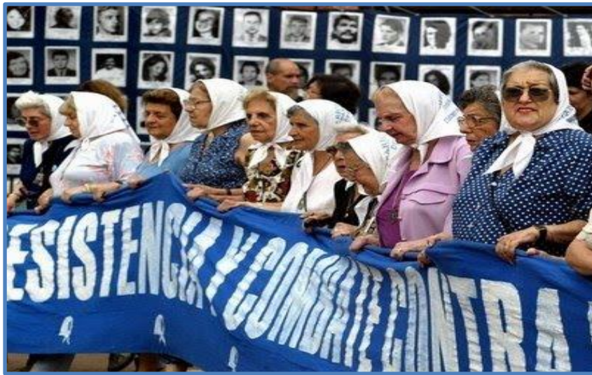
Picture 3: The March of Resistance - Madres Plaza de Mayo (Argentina)

I would like to argue in this third part that if we can better understand the communicative and expressive dimensions of collective actions of victims' group of the global south from a transnational perspective, it is possible to analyse how civil society creates social cohesion, developing a sense of trust and a spirit of collaboration to promote peace, co-operation and reconciliation in contemporary fragile social contexts. My proposition is that the construction of symbols articulating the communicative dimensions of political, social and cultural rights, can help civil society groups and social movements to restore a sense of citizenship and collective belonging. It would also generate processes of construction of social memory, recognition and solidarity from a counter public perspective. In the case of the victims' groups of Eastern Antioquia, the construction of social, historical and cultural memory from a victims' perspective and the implementation of symbols of other victims' groups of the global south is a tool to claim truth and reparation in the midst of the armed conflict.