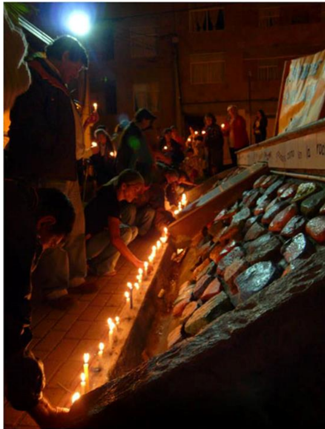
Picture 2: The Walls of Memory - Cocorná town (Eastern Antioquia)

to collect information about individuals, groups, important events or everyday life issues in order to preserve the knowledge and understanding of people from an eyewitness's point of view (Gordon and Jones, 2002; O'Neill, 2009). Finally, I also relied on focus groups, a qualitative data collection method which usually involves recruiting a small group of people. These people tend to share particular characteristics in order to encourage an informal group discussion – or discussions – focused around a particular topic or set of issues (Bryman, 2008; Silverman, 2011). The main outcome that stems from using this set of qualitative methods is the constitution of an in-depth documentation of the socio-communicative and symbolic practices of AMOR and APROVIACI from 1995 to 2015. This documentation provides key insights on the reconstruction of motivations, reasons and understandings behind these socio-communicative strategies.