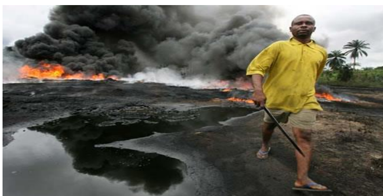
Fig. 4 Presentation on the oil industry in Nigeria

UNEP Environmental Assessment, Ogoniland 2011