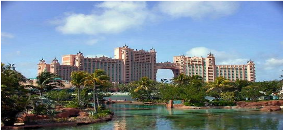
Fig. 2 Presentation on the the financial crisis and the Bahamas