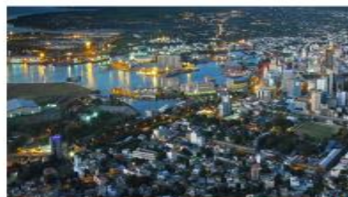
Fig. 3 Presentation on Mauritius and globalization