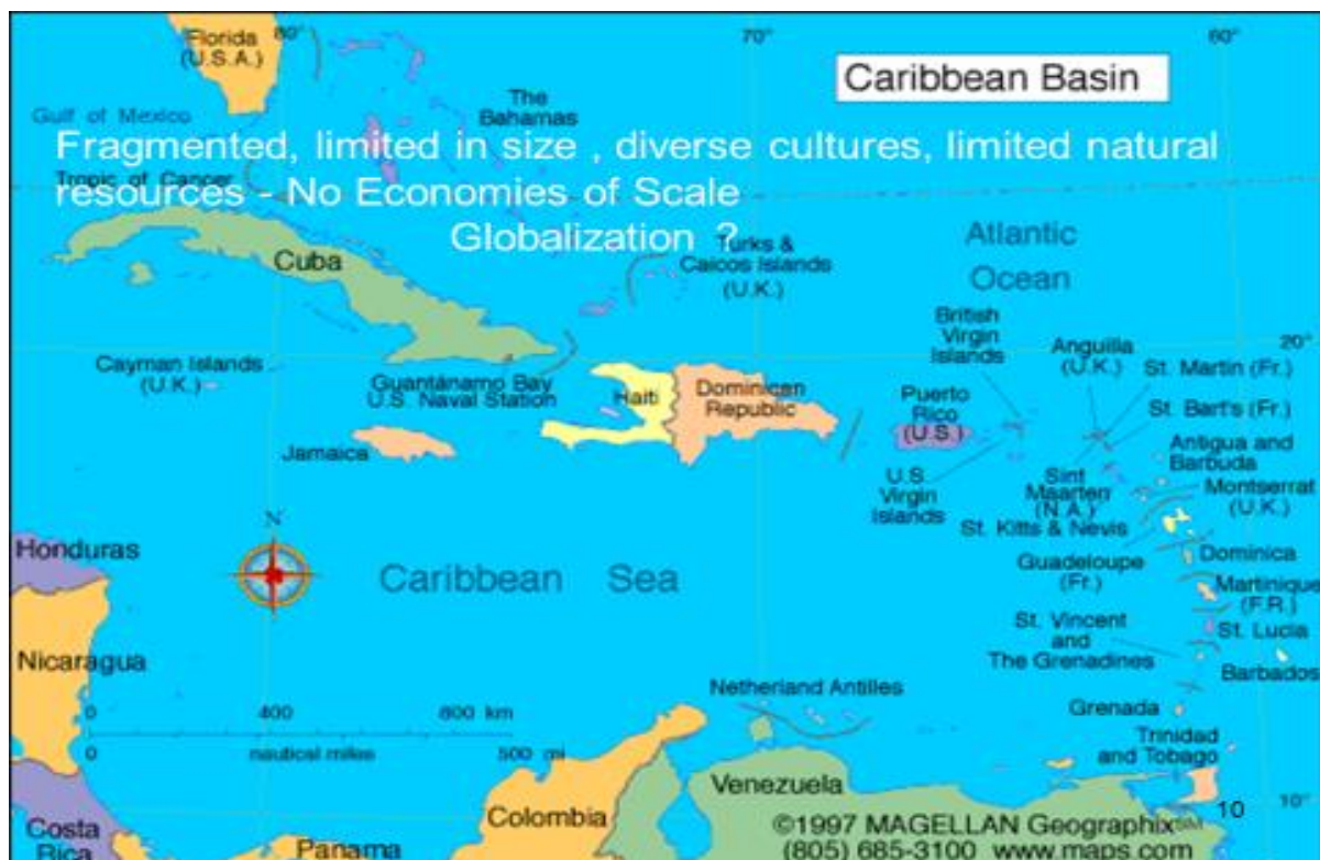
Fig.1 Presentation on Saint Lucia, the Caribbean and its place in the global economy